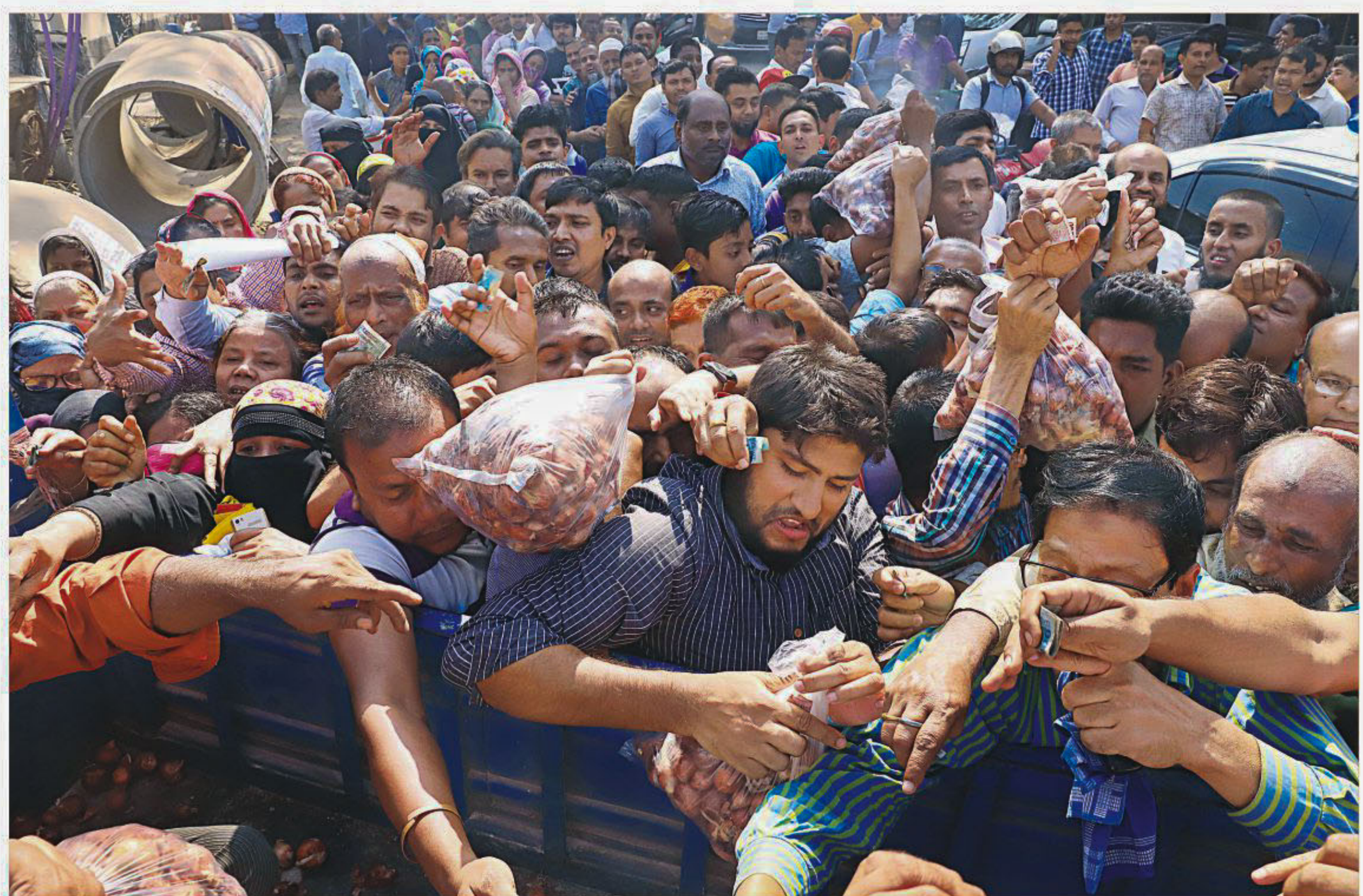
People jostling to buy onions at Tk 60 a kg from a truck of the state-run Trading Corporation of Bangladesh (TCB) in the capital's Press Club area yesterday. Onion prices at kitchen markets have hit a record high, with each kg selling for Tk 220.

Terming the crisis artificial, senior treasury and opposition bench lawmakers yesterday came down heavily on the government in parliament for failing to check skyrocketing onion prices. They said people were suffering and the government's failure to bring down the prices of the daily essential would trigger negative reaction from the people. The MPs, taking the floor on points of order, said there was "no shortage" of onions in the market and the crisis was artificially created. The prime minister was present when lawmakers vented their displeasure. Later, she too said that unscrupulous traders were hoarding onions. Awami League senior parliamentarian Mohammad Nasim said, "Commerce minister [Tipu Munshi] and finance minister [AHM Mustafa Kamal] are saying that onions are being imported, then why prices are shooting up every day?" "It is not understandable. It is tarnishing our image. It will be bad for us if people start to react," said Nasim, who launched the criticism. "When the commerce minister makes statement that price of a kg of onions will not come down to Tk 100, then SEE PAGE 2 COL 1