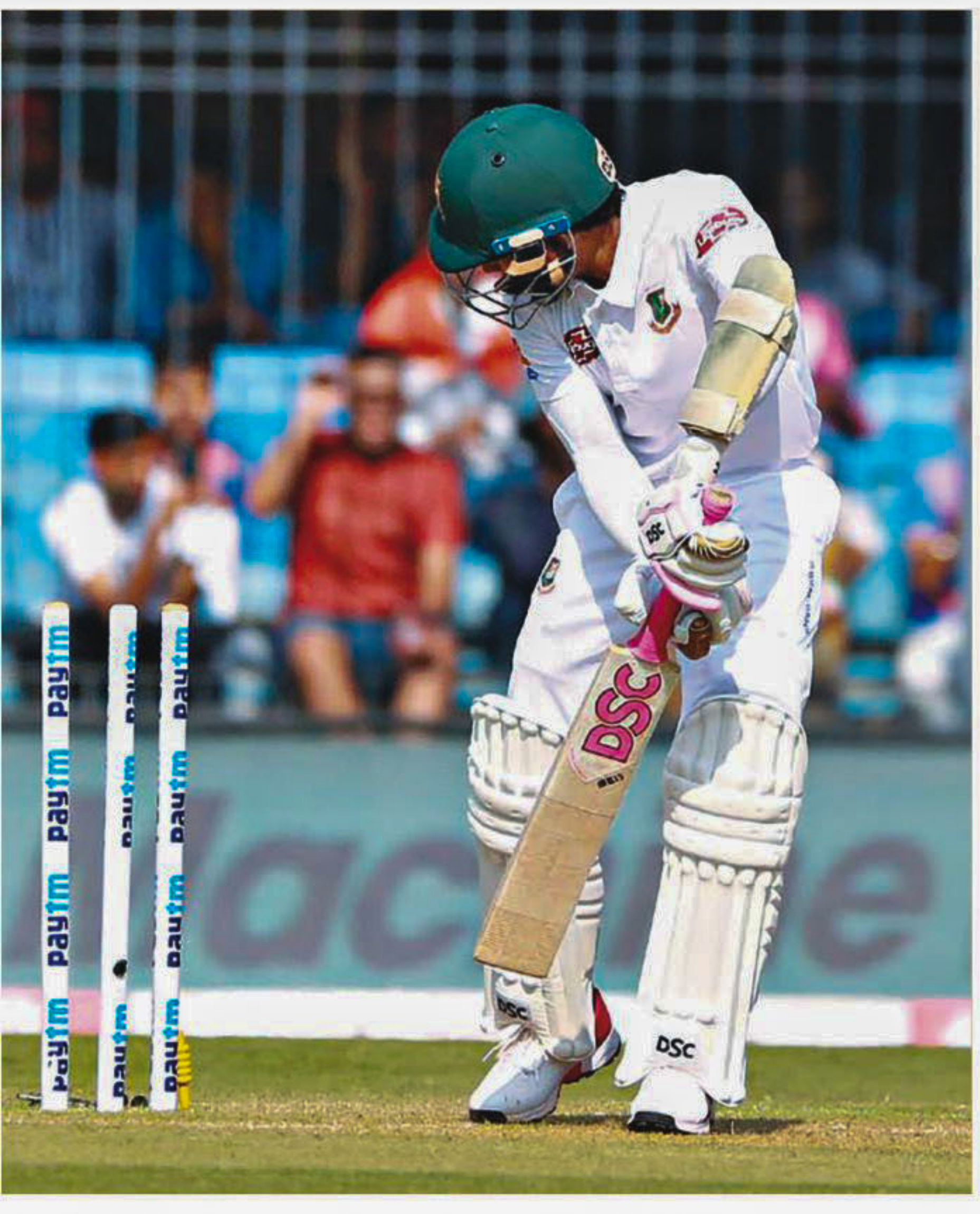
Even Bangladesh's most experienced batsman, Mushfiqur Rahim, could not withstand the sustained onslaught of India's pacers on the first day of the first Test at the Holkar Stadium in Indore yesterday.