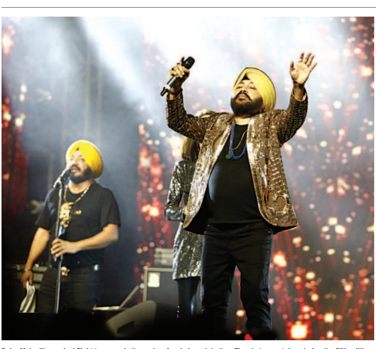
Daler Mehndi's musical flight transcends the realm of melody and rhythm. The photo was taken during the fifth edition of the Dhaka International Folk Festival 2019 at the Army Stadium late last night.

Fazr Juma Asr Maghrib Esha AZAN 5-35 12-30 3-45 5-22 7-00 JAMAAT 5-35 1-15 4-00 5-25 7-30 SOURCE: ISLAMIC FOUNDATION