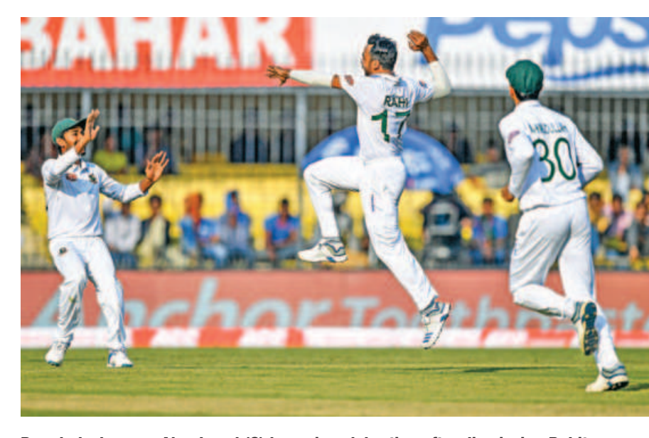
Bangladesh pacer Abu Jayed (C) leaps in celebration after dismissing Rohit Sharma, the only Indian wicket to fall on the first day of the first Test in Indore vesterday. India were 86 for one at stumps.