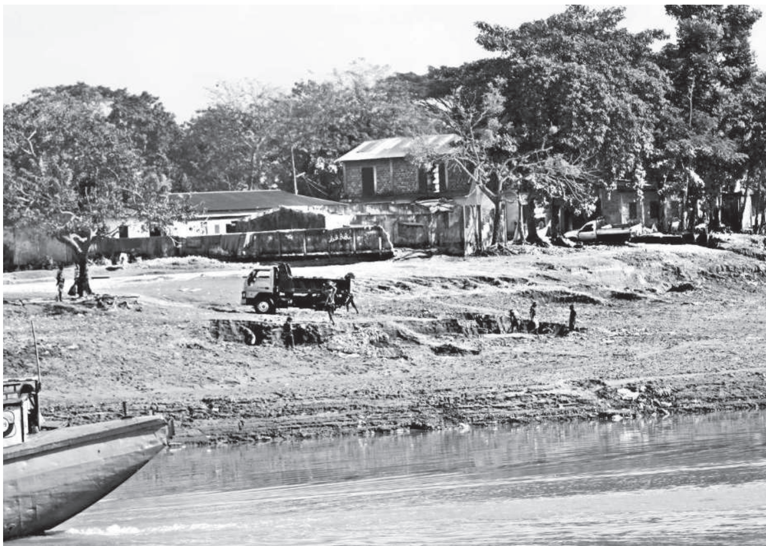
Unscrupulous traders extract earth from different places on the Surma river for sale to owners of brick kilns and realtors, posing risk of erosion in the nearby areas. The photo was taken from Gowaipara in Sylhet city yesterday.

The arrestees were later produced before a court in Thakurgaon, said the DD.