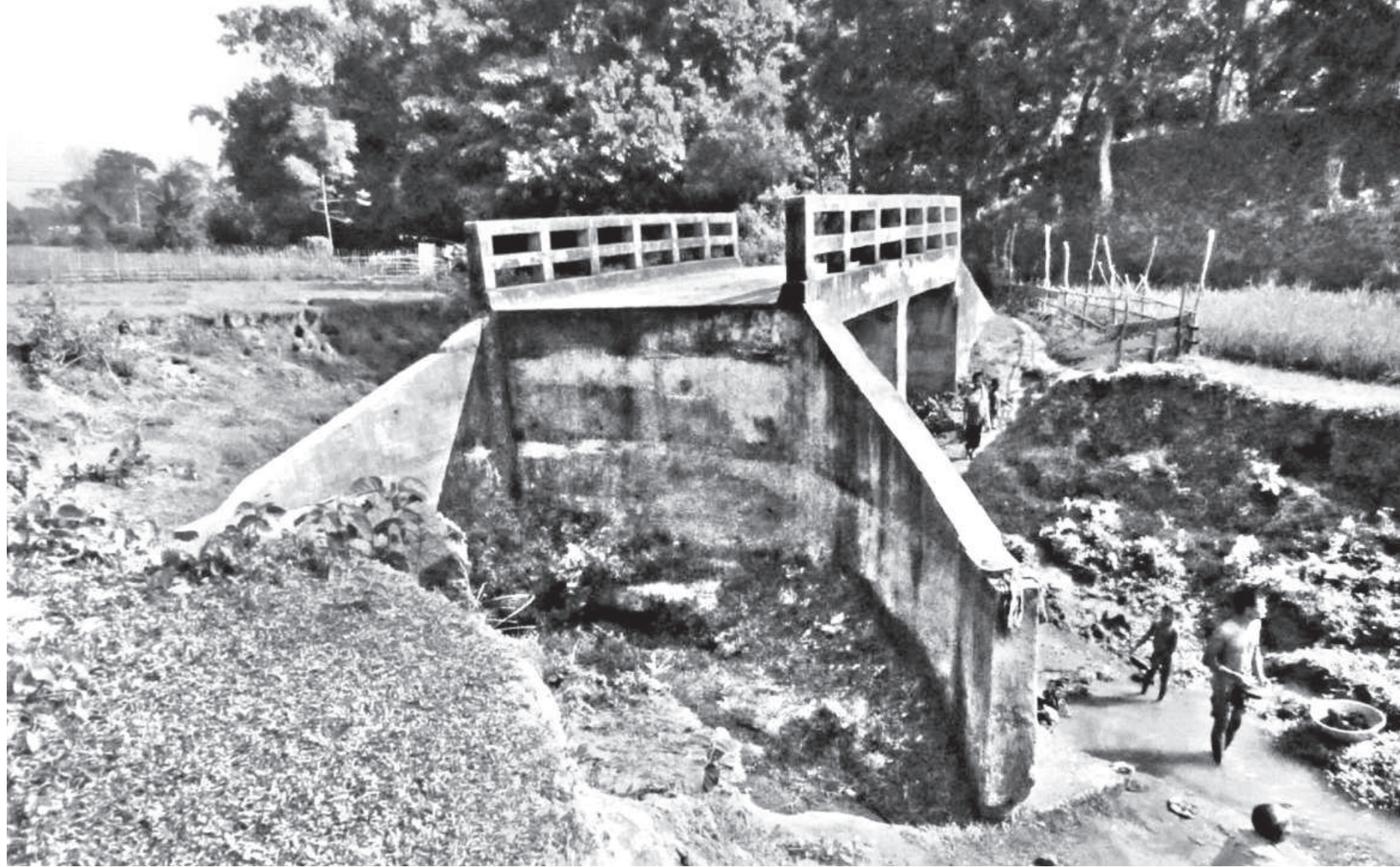
This culvert at West Golabari under Golabari union in Khagrachhari Sadar upazila fails to facilitate vehicular movement as the earthen road on either side have not been made usable for vehicles.