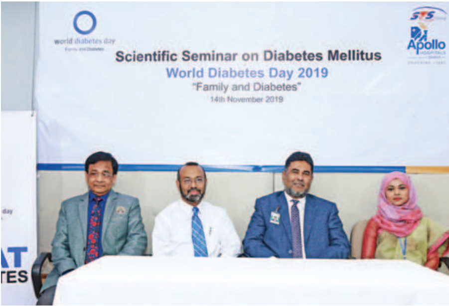
Apollo Hospitals Dhaka organised a scientific seminar on diabetes at the hospital's auditorium. A rally was also held inside Bashundhara Residential Area to observe World Diabetes Day.