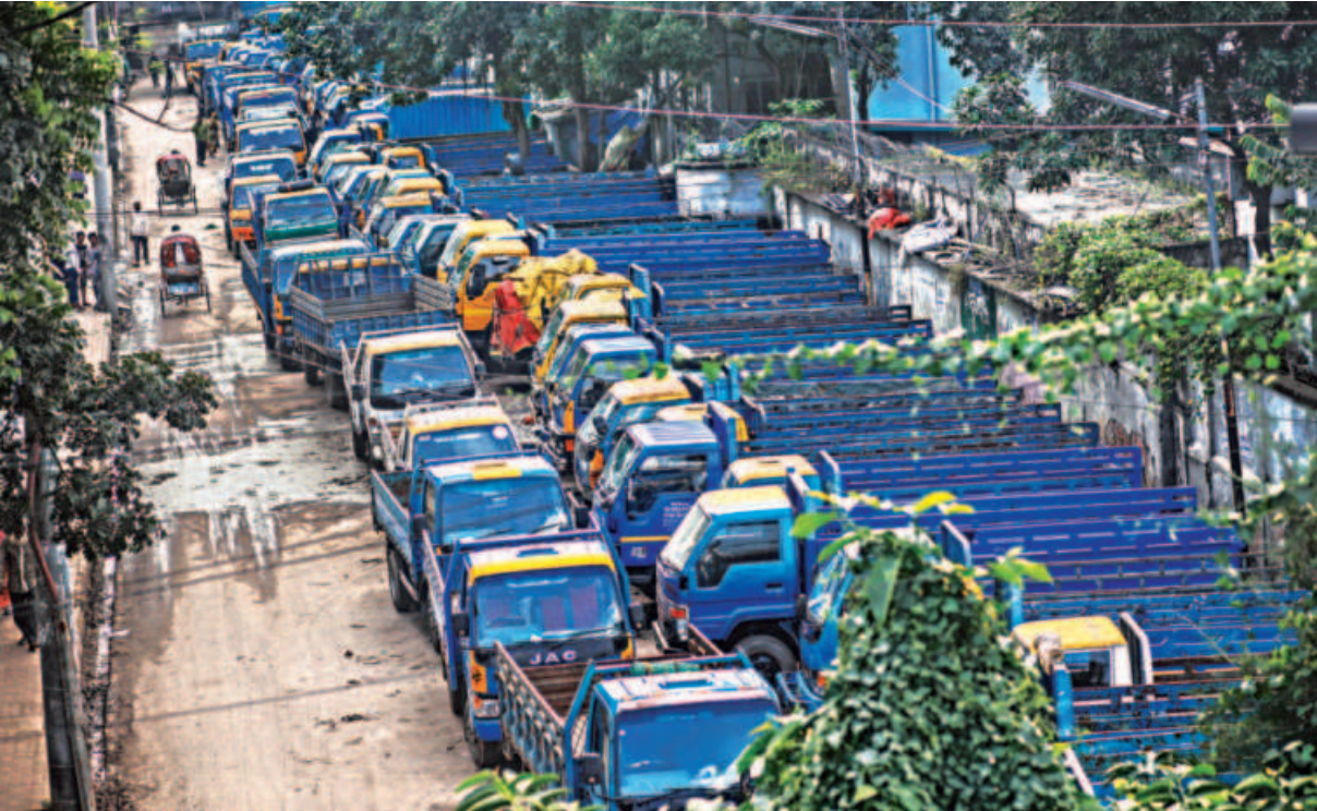
Parked pick-up trucks take up almost the whole street, leaving only one lane for commuters in the capital's Tejgaon. The area has designated truck stands but these drivers rarely follow the rules.