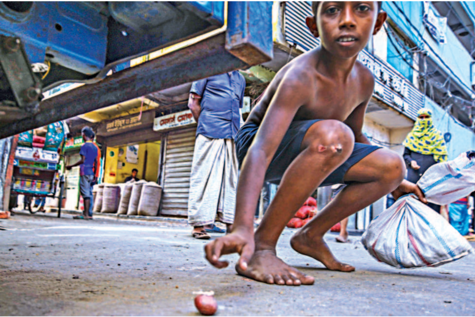
THE LITTLE OPPORTUNISTS ... Soaring onion prices have caused a frenzy across the country, but a group of enterprising street children in Chattogram are making the best of it. They pick up onions that slip through while unloading from trucks at the Khatunganj wholesale kitchen market, and sell those at nearby shops. They say they can gather five to 10kg of onions. The photos were taken last week.