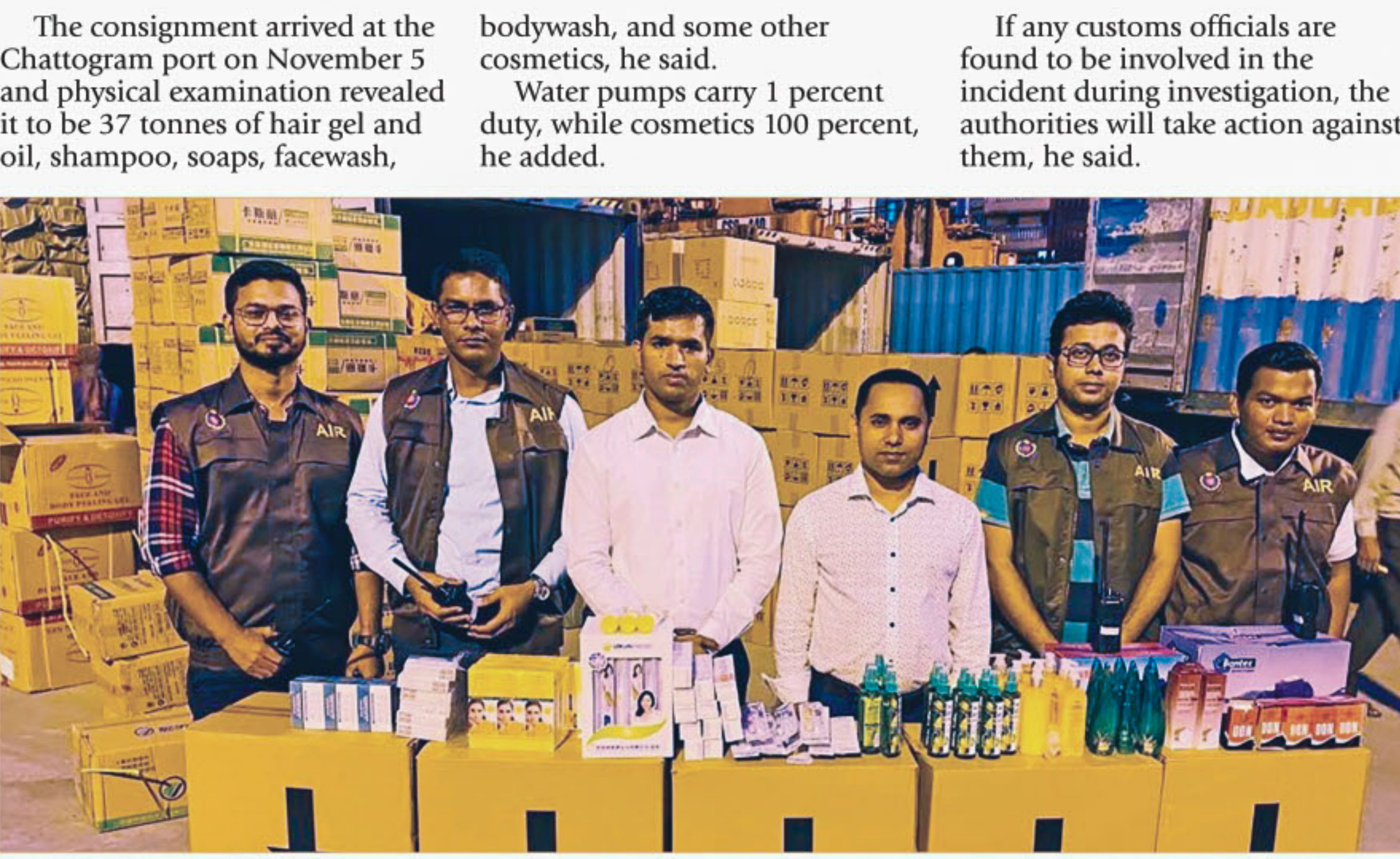
Customs officials at Chattogram pose with some of the Tk 2 crore-worth cosmetics seized yesterday for allegedly being imported under the false declaration of being water pumps.