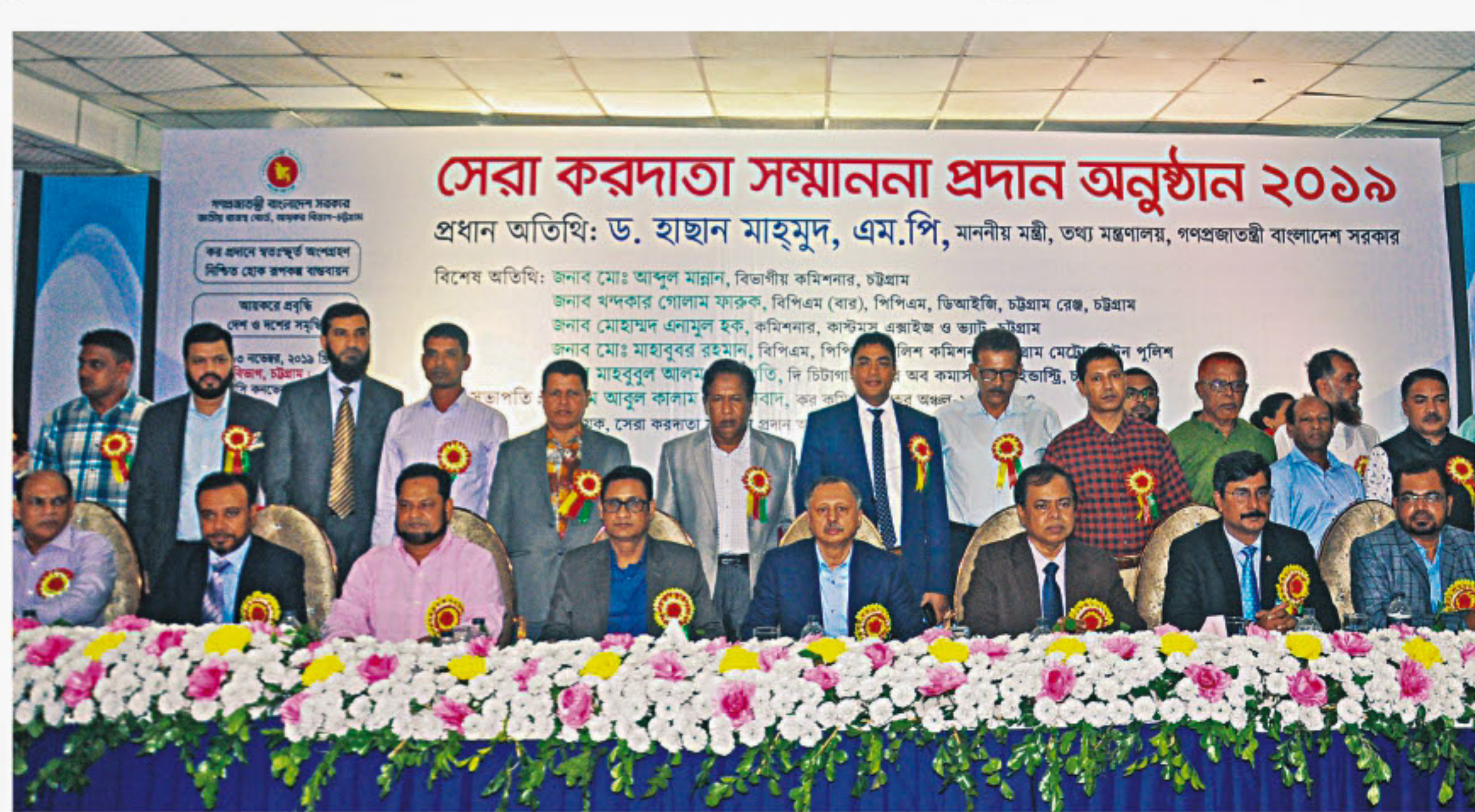
Top taxpayers pose at an event at the GEC Convention Centre in Chattogram yesterday when 115 taxpayers from the port city and Khulna were awarded by the NBR.

STAFF CORRESPONDENT, Ctg A total of 38 persons from Chattogram, Bandarban, Rangamati, Khagrachhari and Cox's Bazar were awarded yesterday as best taxpayers under four categories. The award crests for fiscal 2018-19 highlighted the highest amount of tax paid by a person, woman and under-40 youth and taxpayer of the longest period. The recognition came at a ceremony organised by Income Tax Department at GEC Convention Centre in Chattogram city. Addressing it as chief guest, Information Minister Hasan Mahmud said income tax in Bangladesh accounted for 10 percent of the GDP, lower than that in Nepal. Honouring taxpayers aims at encouraging people to pay tax and such programmes need to be extended to the upazila level, he said. READ MORE ON B3