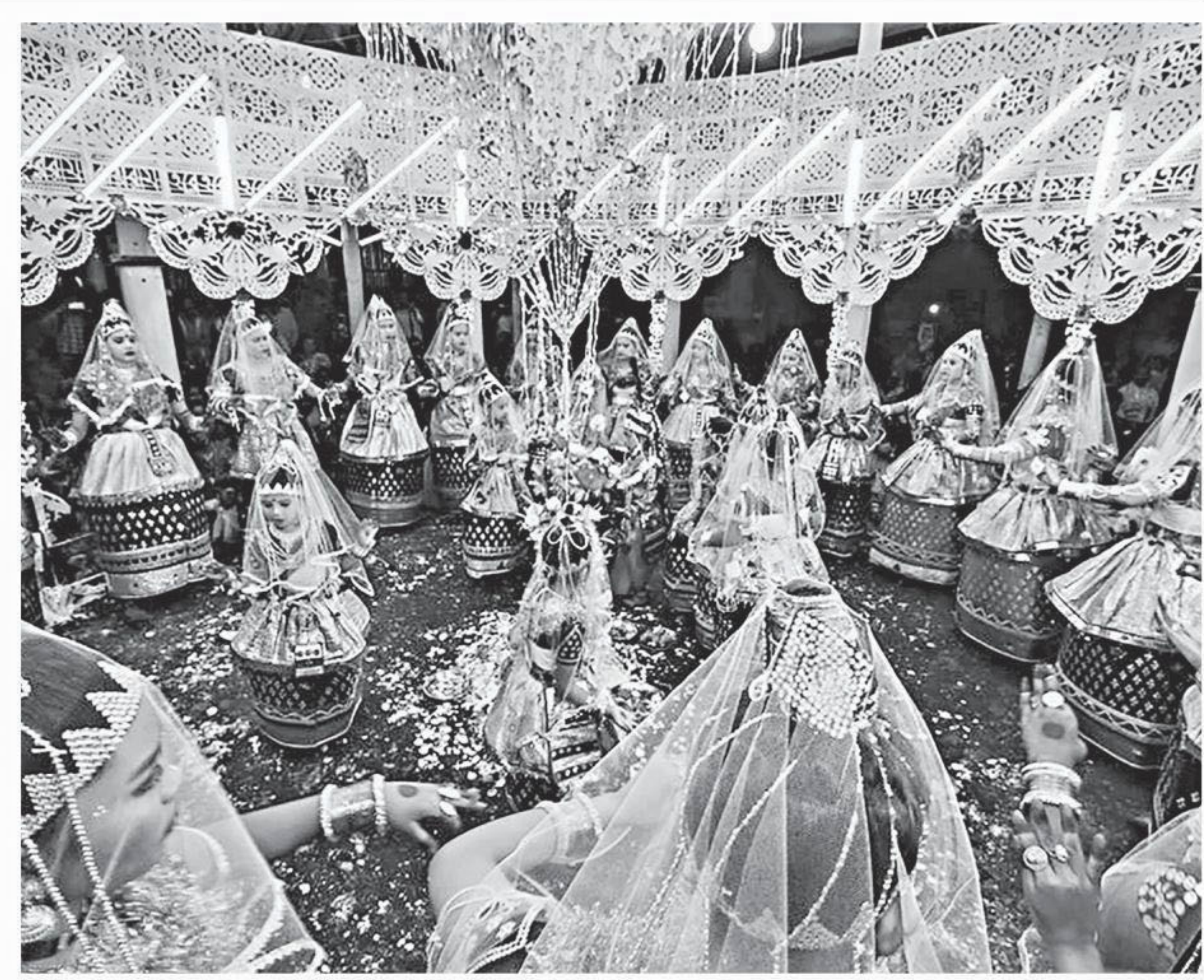
Manipuri girls in traditional dress dance at Moha Ras Lila festival in Kamalganj upazila of Moulvibazar on Tuesday.