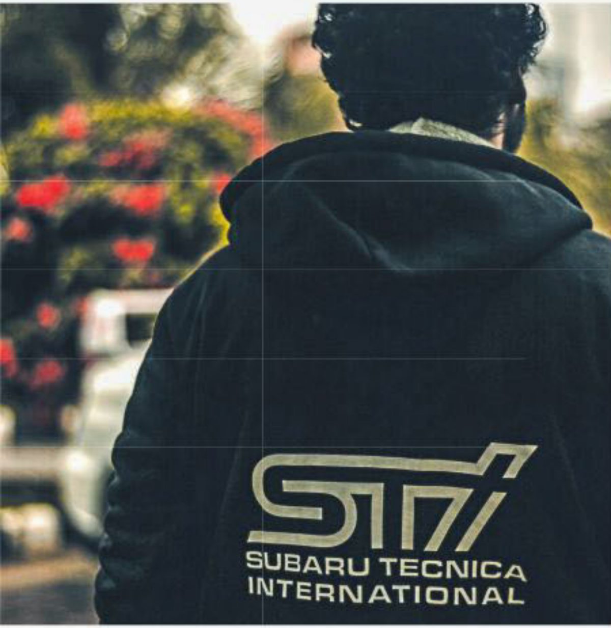
Vape nation - Subaru owners unite! If it's for cars like the fantastic blob-eye Impreza (see right), we're in.