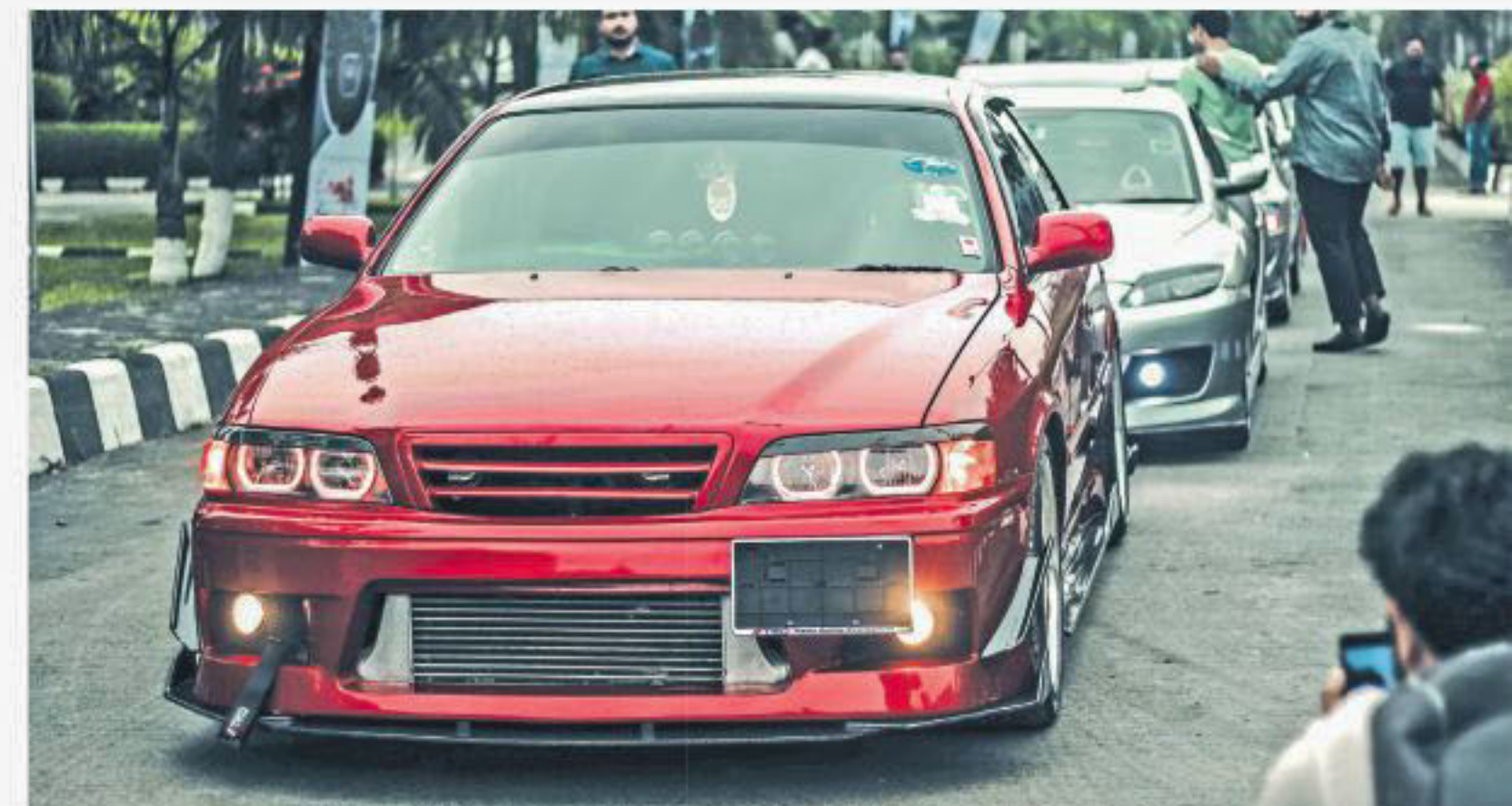
RWD turbo luxury sedans - this Chaser got VIP treatment throughout.