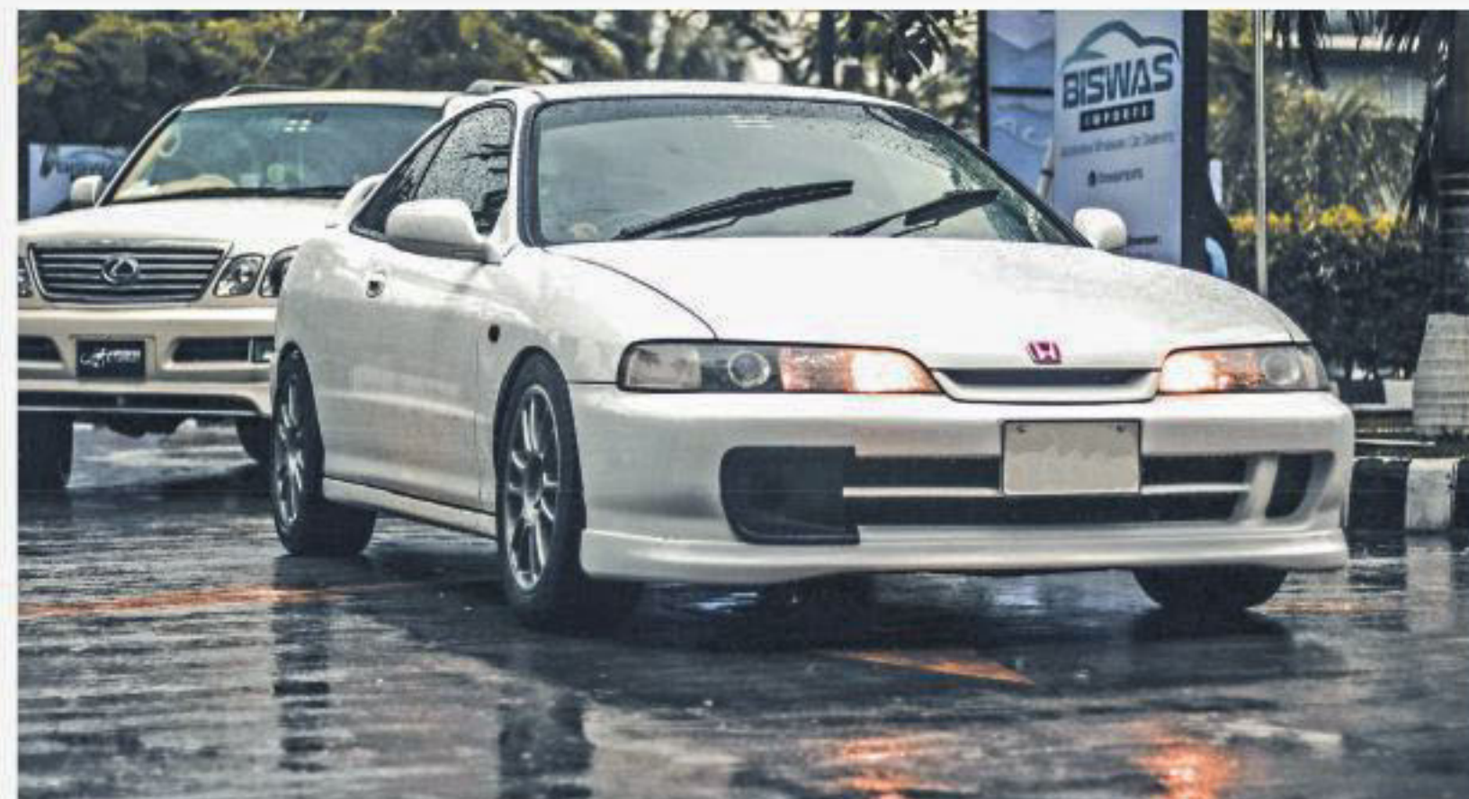
FWD and naturally aspirated, but still welcome - you don't refuse Integras!