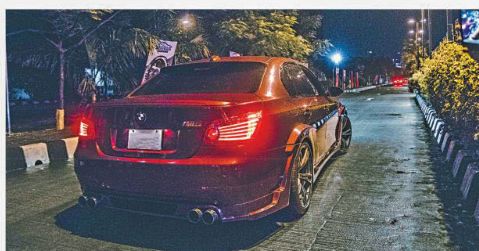
BMW M5 V10 - supercar sounds, performance and presence.