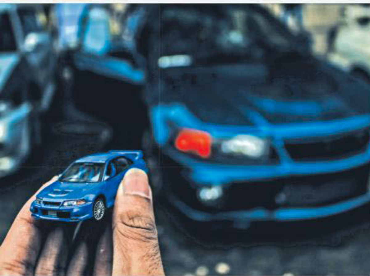
There's always that geek that takes scale models to 1:1 meets. They're our kind of geeks.

Biswas Imports and the Evo STI Owners Club Bangladesh partnered up and hosted the All Turbo Car Show on Saturday, November 9, 2019 at International Convention City Bashundhara. The Evo STI owners club has been hosting meets once a year, every year for the past seven years and this was their biggest yet.