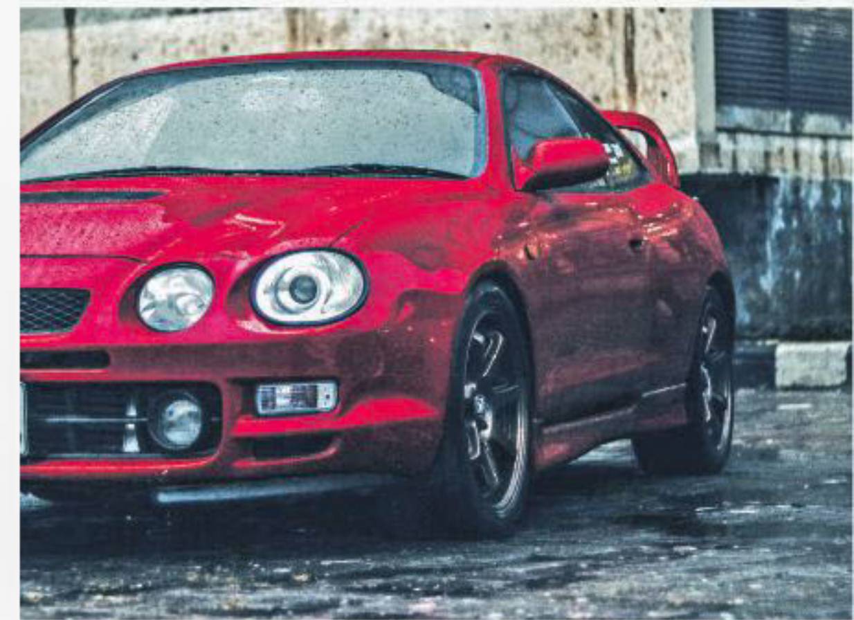
An ST20X 3SGTE Celica - missing its AWD Celica GT-Four brother among all these Evos and STIs?

WORDS: HASEEB CHOWDHURY