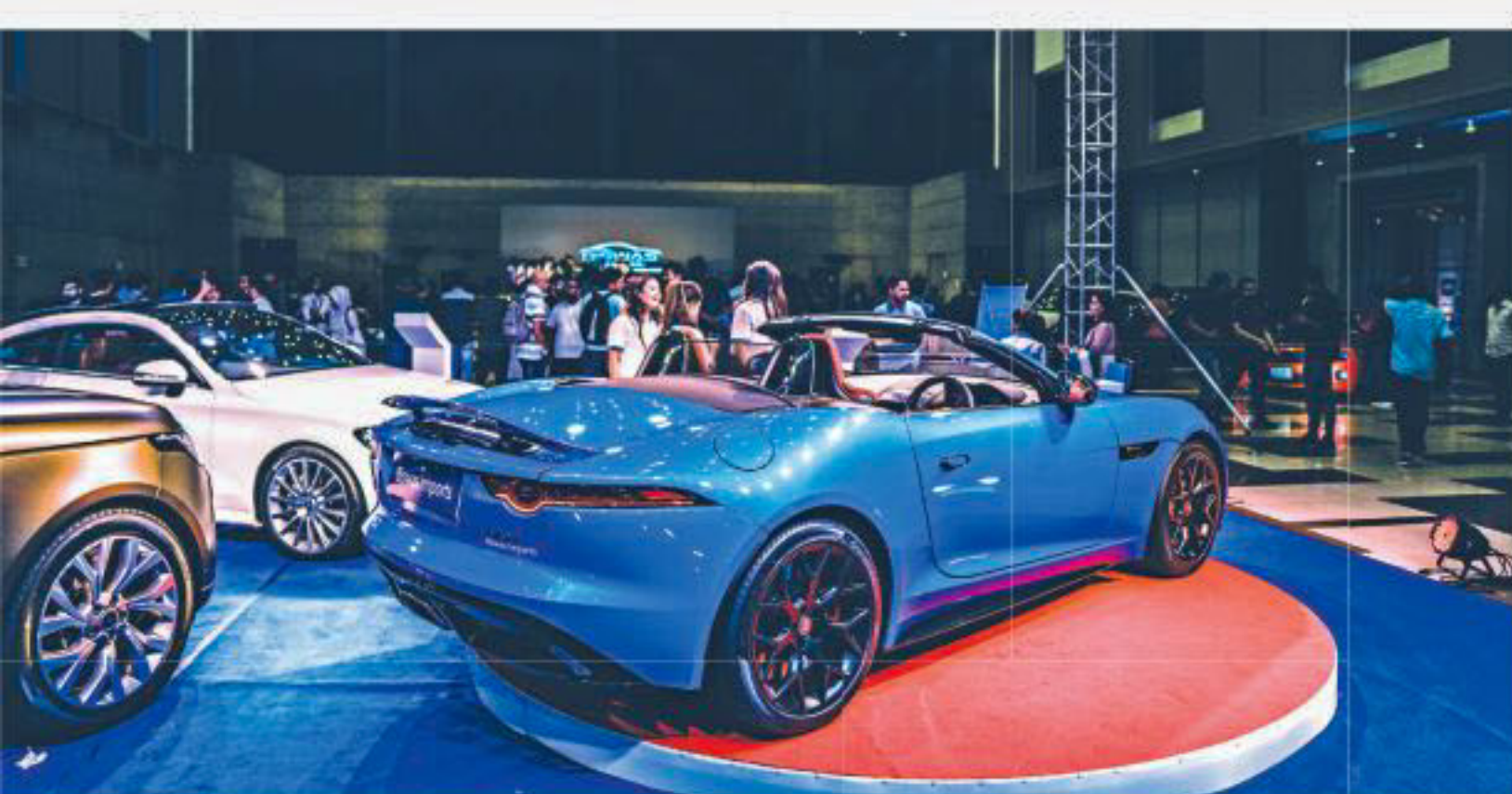
Biswas Imports' Euro flavours - Jaguar F-type is sublime, and for sale.