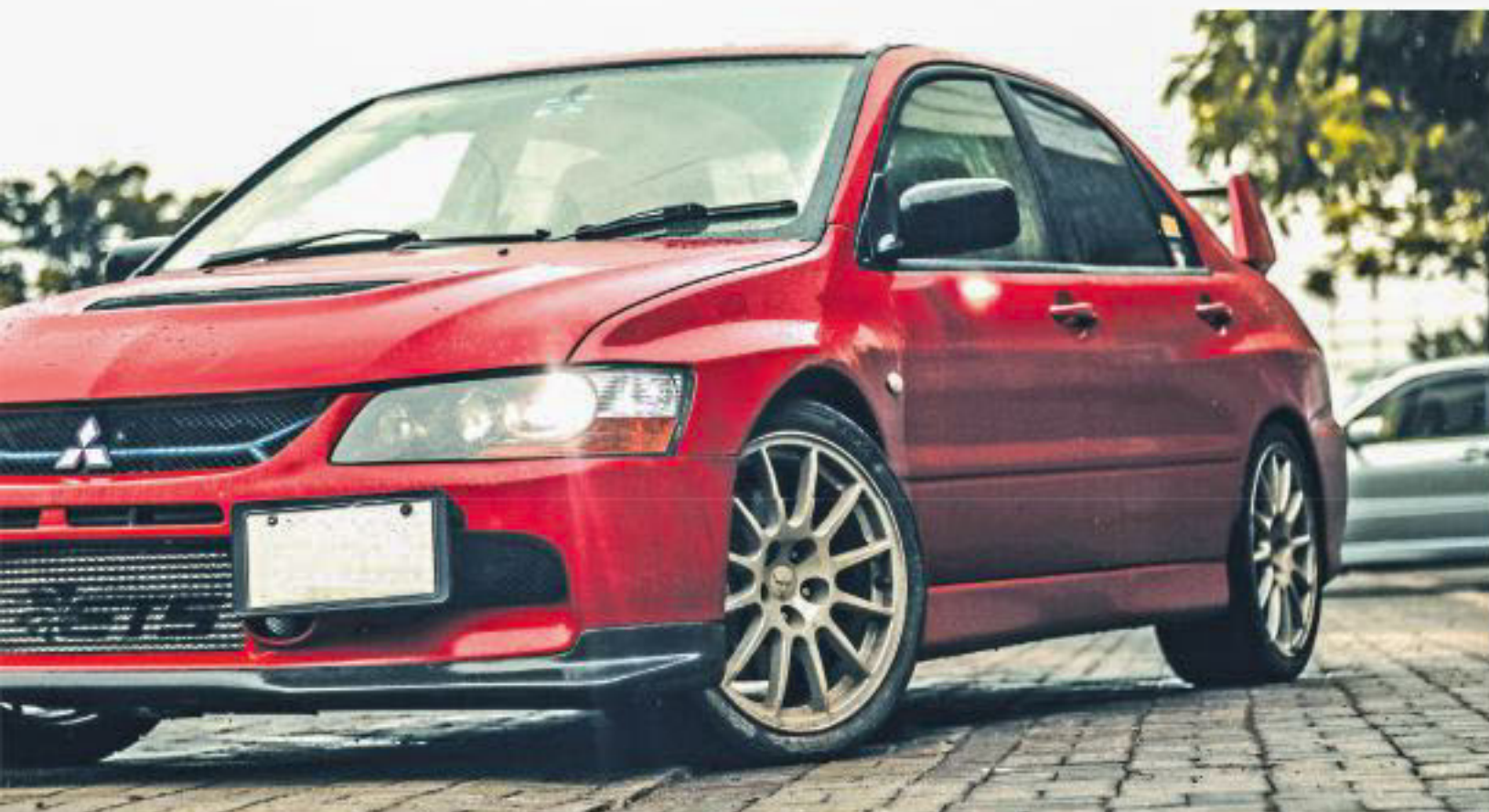
AWD Turbo goodness - the Mitsubishi Lancer Evo is still a favourite.