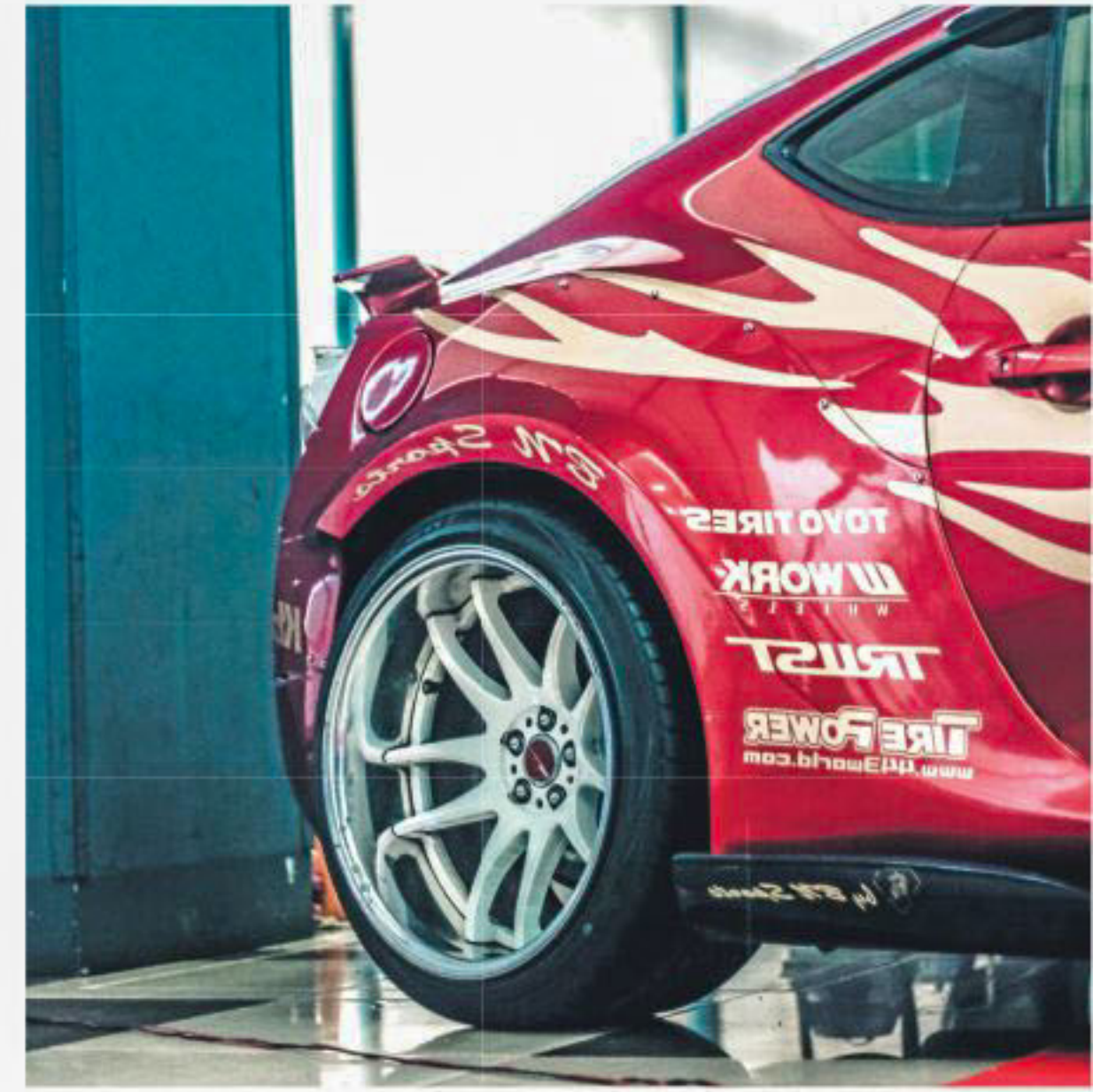
From the Tokyo Auto Salon to ICCB - the BN Sports GT86 has come a long way.