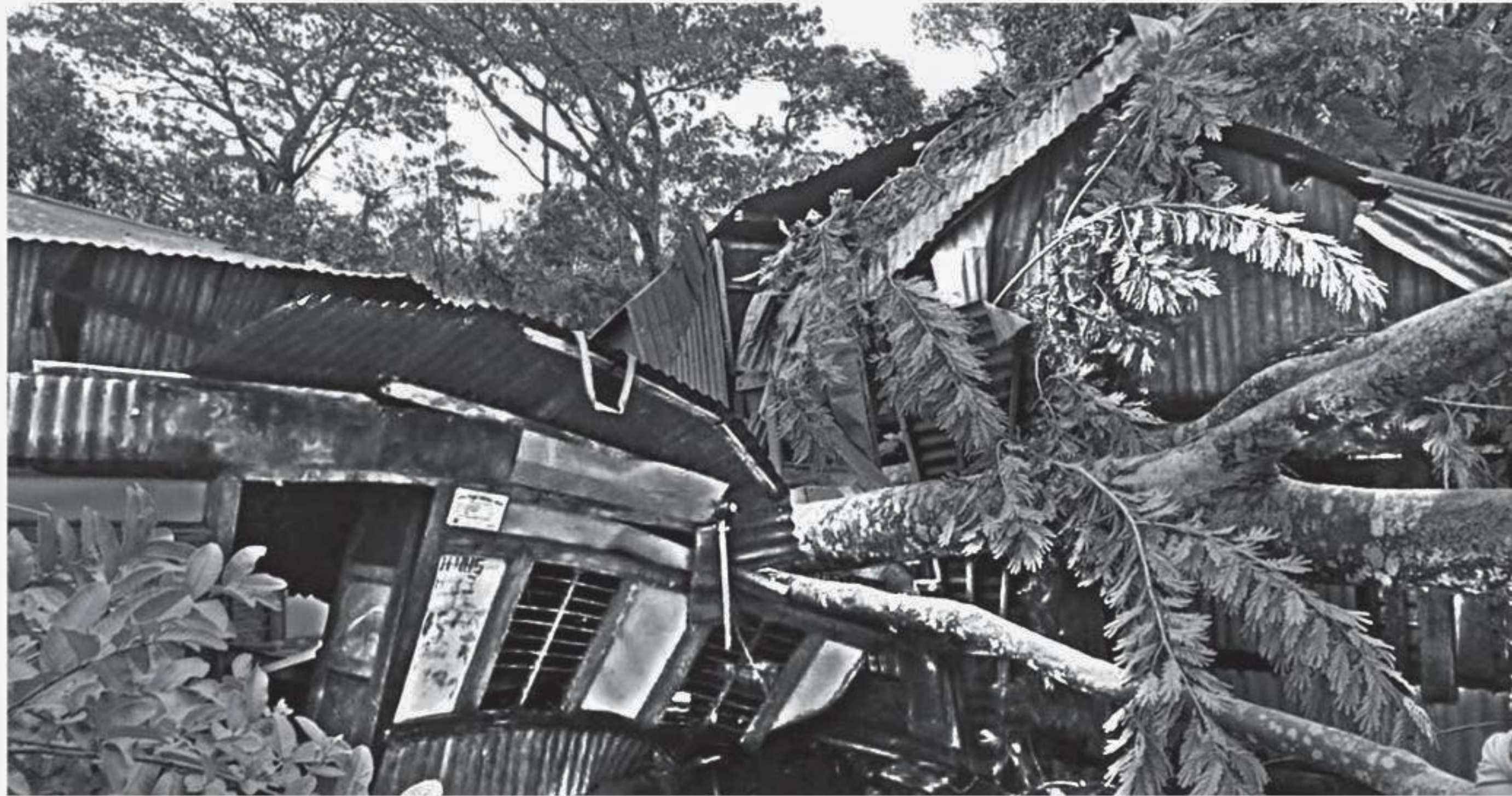
Many houses and trees were damaged by cyclonic storm 'Bulbul' which lashed Bangladesh's coastal districts on November 10.

climate change in view is called Index Based Insurance (IBI) or parametric insurance. This is an innovative insurance scheme with a number of pilot schemes in the Caribbean, Africa and Asia, providing some initial interesting results. The difference between IBI and traditional insurance lies in the fact that whereas traditional insurance pays the client after the damage is done and assessed by the insurer, with IBI, the trigger for making payments is a previously agreed threshold of climate event, such as a cyclone reaching a certain speed or a flood above a certain