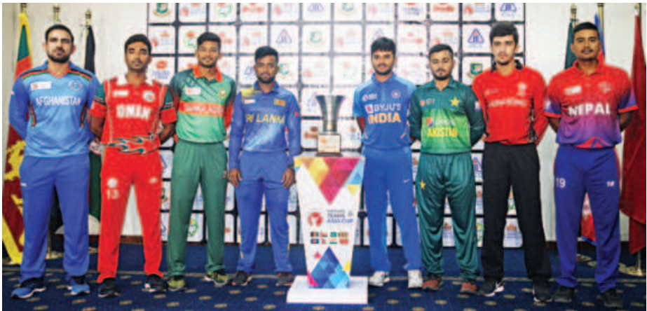
The trophy for the ACC Emerging Teams Asia Cup 2019 was unveiled at a city hotel yesterday. The captains of each of the eight participating teams attended the ceremony for the tournament, which is set to begin on November 14 at different venues across the country.

Barcelona midfielder Ivan Rakitic has withdrawn from the Croatia squad due to an Achilles injury, his club confirmed on Tuesday. Rakitic will miss Croatia's Euro 2020 qualifier against Slovakia on Saturday. Croatia sit top of Group E but only two points clear of Hungary with one game left to play. Rakitic will also be unavailable for Barca's charity match against Cartagena on Wednesday, along with Jordi Alba and Nelson Semedo, who are suffering from hamstring and calf problems respectively. Gerard Pique, Ousmane Dembele and Sergi Roberto have been named in a youthful squad for the friendly, which will see ticket proceeds donated to victims of the floods around Cartagena in September.