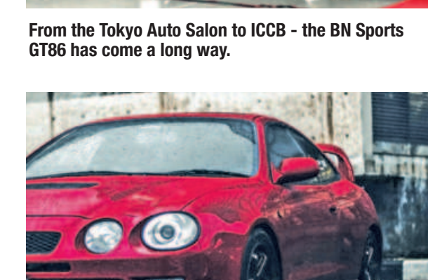
An ST20X 3SGTE Celica - missing its AWD Celica GT-Four brother among all these Evos and STIs?