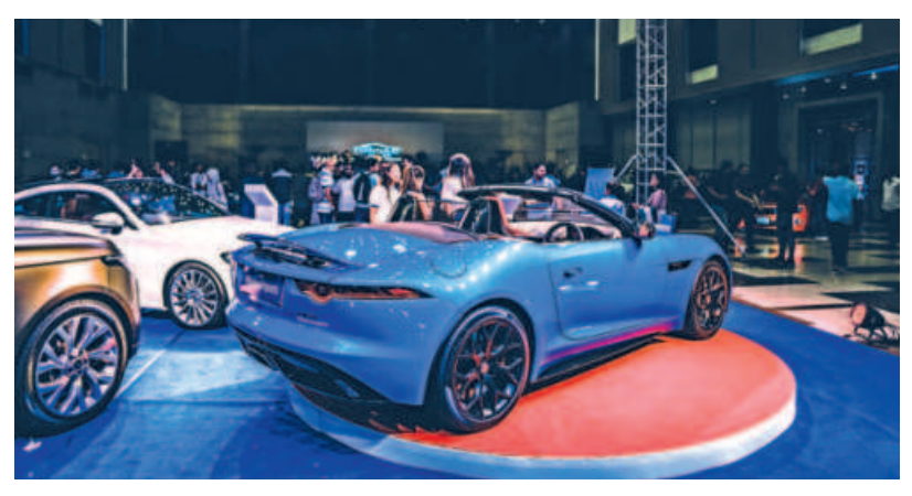
Biswas Imports' Euro flavours - Jaguar F-type is sublime, and for sale.