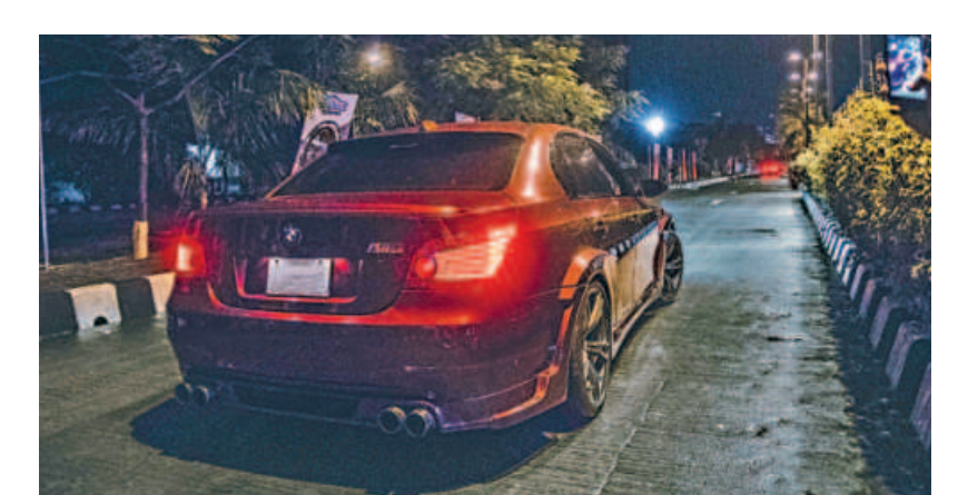
BMW M5 V10 - supercar sounds, performance and presence.