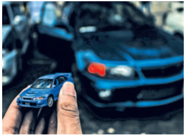
There's always that geek that takes scale models to 1:1 meets. They're our kind of geeks.