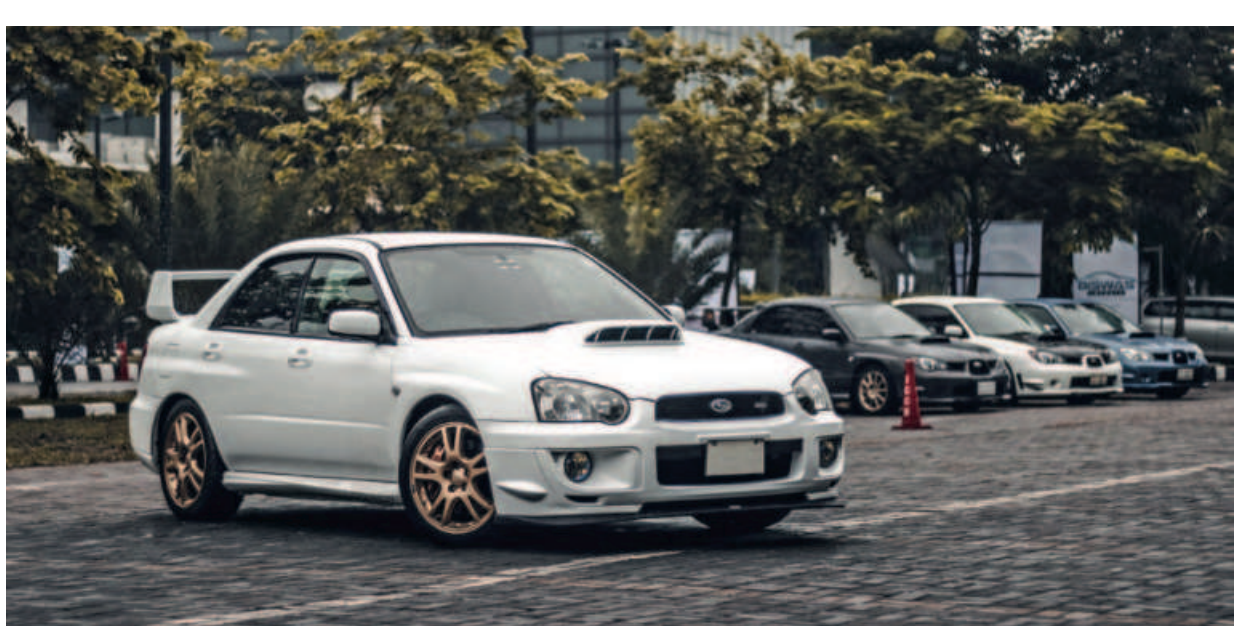
Biswas Imports and the Evo STi Owners Club Bangladesh partnered up and hosted the All Turbo Car Show on Saturday, November 9, 2019 at International Convention City Bashundhara. The Evo STi owners club has been hosting meets once a year, every year for the past seven years and this was their biggest yet.

Despite the looming threat of Cyclone Bulbul, the meet went on-people brought out their project cars, rear wheel drive and all-wheel drive alike. Hall 4, the heart of the event, had about 10 show cars parked inside, but the parking lot had their own share of attractions. Although it was an all turbo car show, there were a few naturally aspirated and supercharged cars. Lancer Evolutions to Subaru Imprezas, a myriad of Toyota JZXs, Starlets, Carinas, Celicas, a 2jz swapped Altezza—the list goes on.