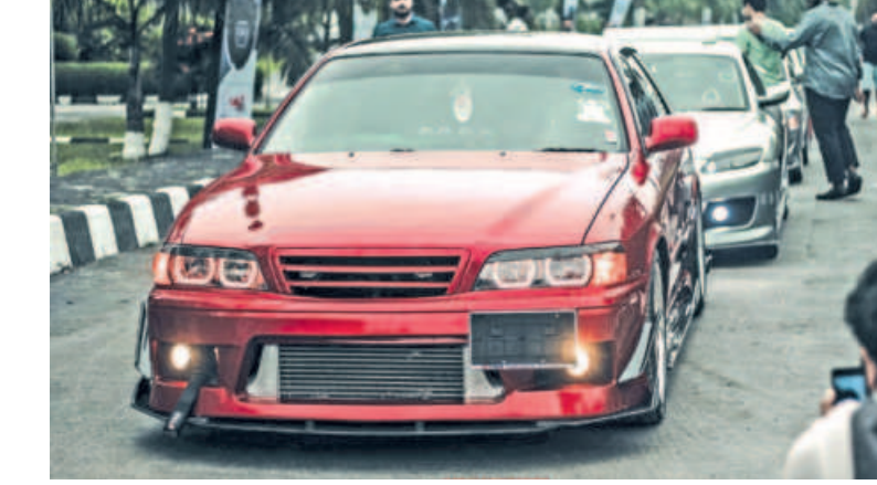
RWD turbo luxury sedans - this Chaser got VIP treatment throughout.