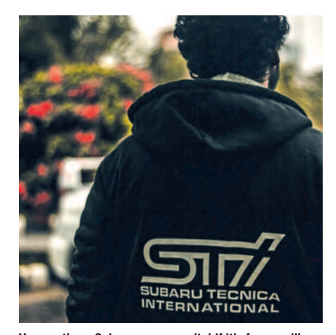
Vape nation - Subaru owners unite! If it's for cars like the fantastic blob-eye Impreza (see right), we're in.