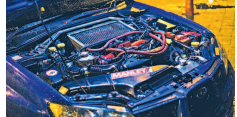
A throbbing Subaru boxer is all you need in life. With lots of tuned goodies.