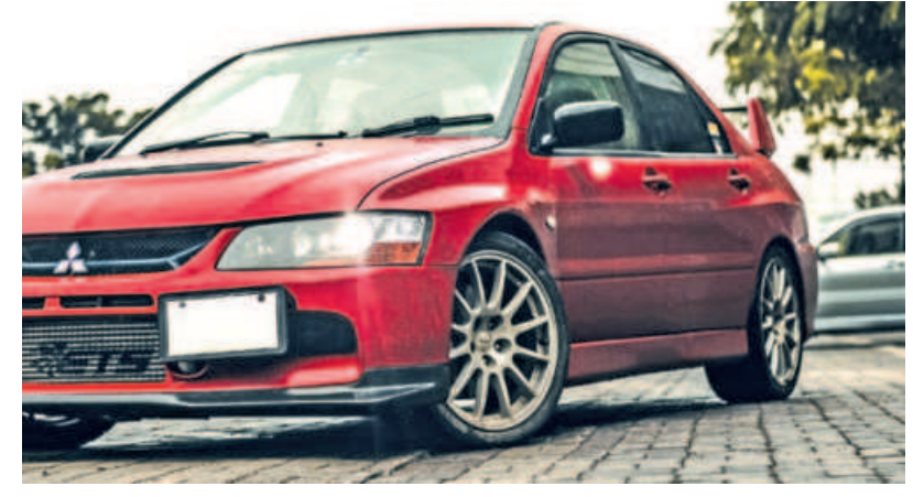
AWD Turbo goodness - the Mitsubishi Lancer Evo is still a favourite.