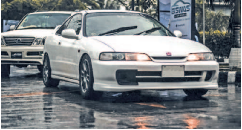
FWD and naturally aspirated, but still welcome - you don't refuse Integras!