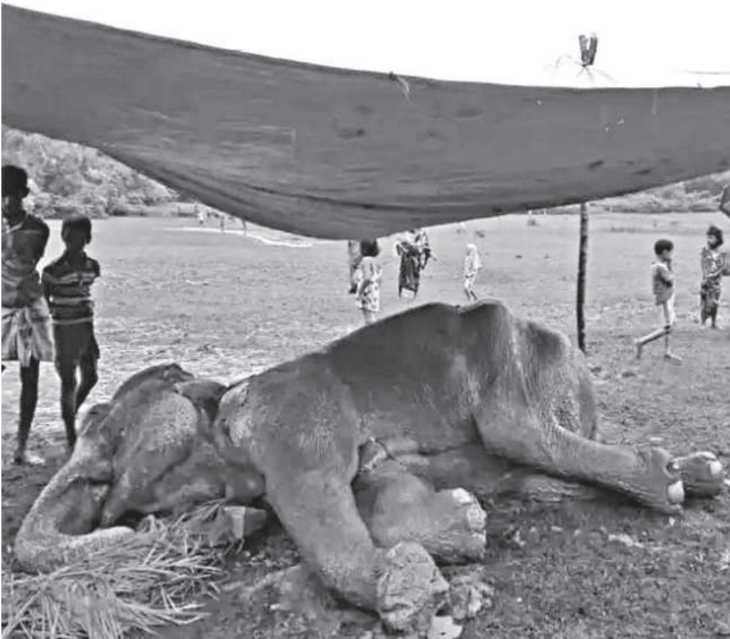
This 70-year-old elephant died on Saturday night from a wound, at the remote hilly area of Lohagara upazila in Chattogram.

Locals and forest officials said flock of elephants often come from the hill in search of food as there is scarcity of food in the hill.