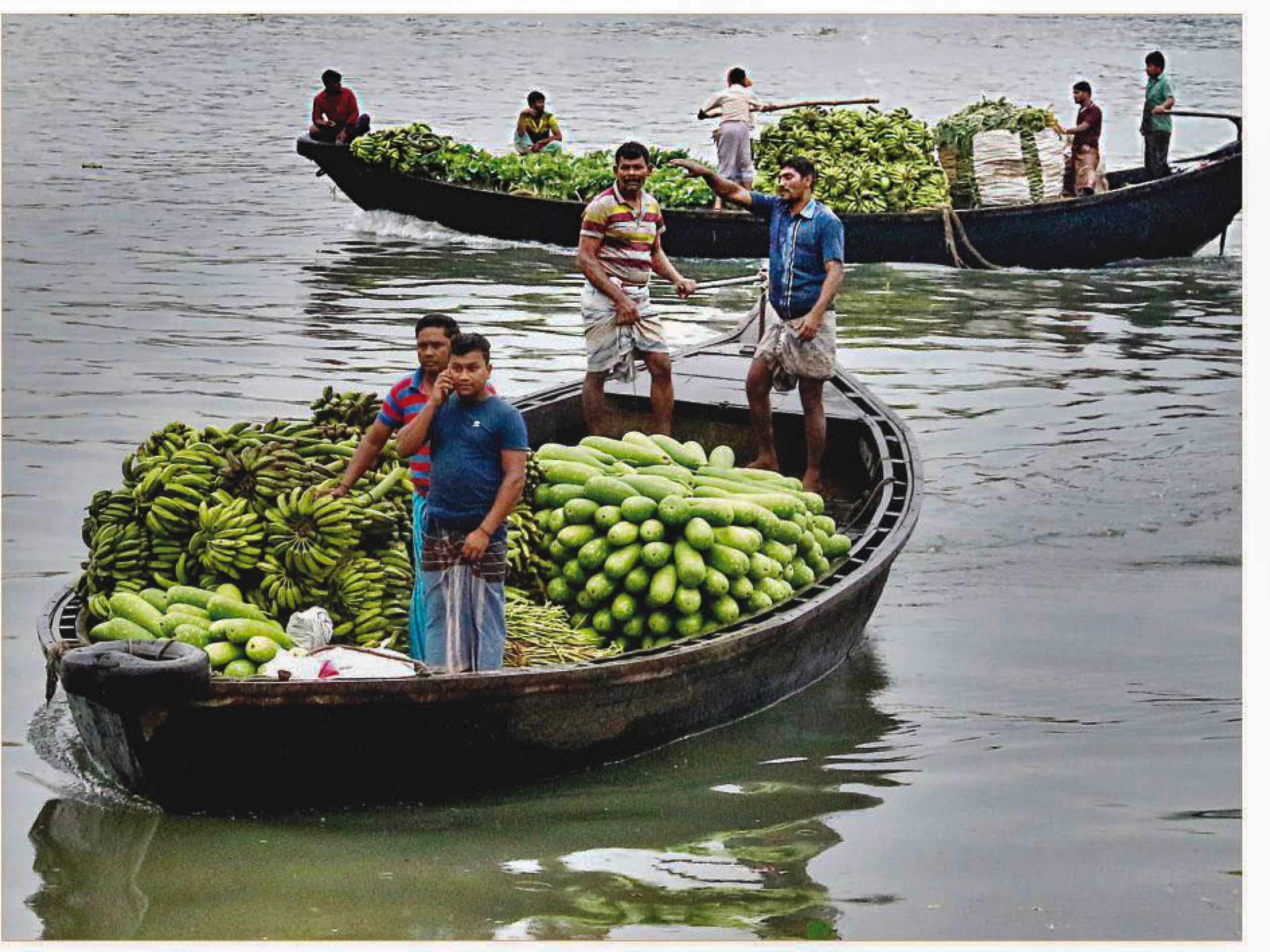
A boatload of winter vegetables is being taken to the capital's Shyambazar. Even though winter has not arrived, some farmers have been blessed with an early harvest of a wide range of vegetables. The photo was taken yesterday.