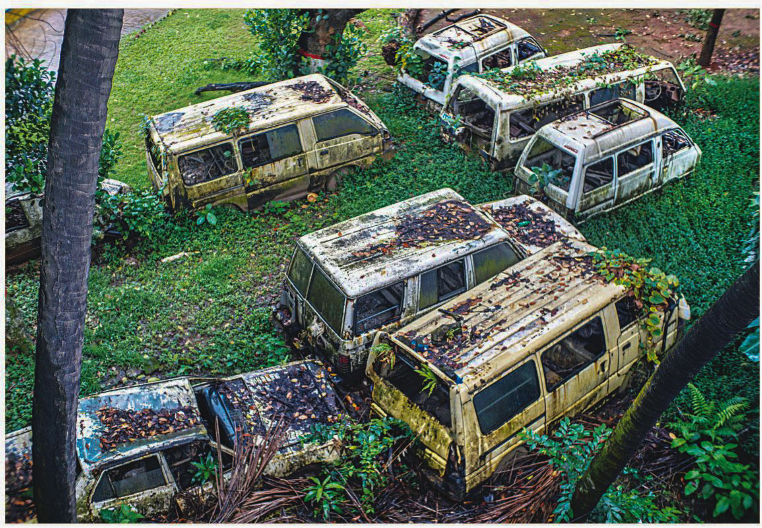
Abandoned vehicles at the front yard of the social welfare ministry's Shishu Paribar, a girls' orphanage in the capital's Tejgaon. The vehicles, left at the mercy of nature, not only ruin the view and occupy what could be a playground for the girls, but also become an ideal breeding ground for mosquitos when rainwater accumulates inside them. The photo was taken yesterday.