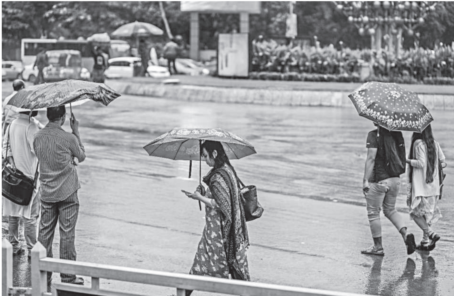
LIFE MOVES ON ... A woman checks her phone as she walks busily, holding an umbrella over her head. Despite yesterday being a weekend, many citizens had to get out of their homes and face the inclement weather triggered by cyclone Bulbul.