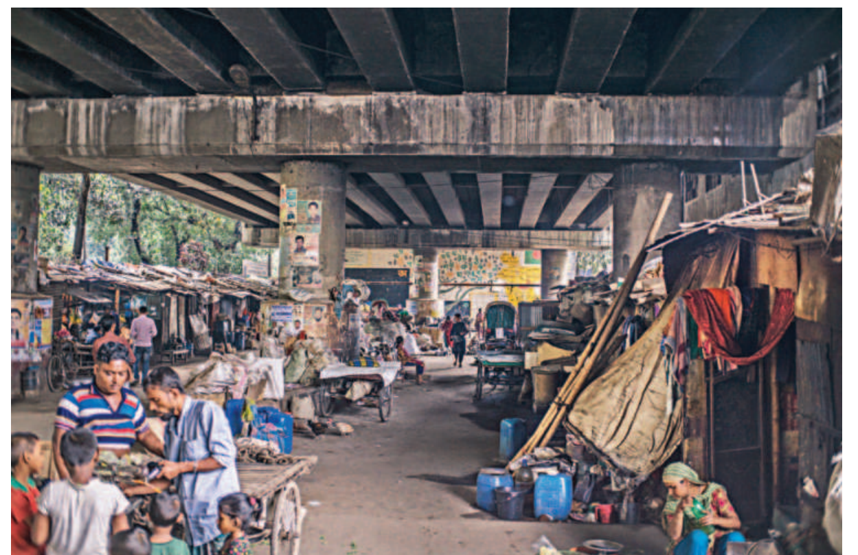
A lion's share of the road underneath the Bijoy Sarani-Tejgaon flyover has been taken over by low-income people, who have set up shops and shanties, keep their rickshaw vans parked here, and even rear chicken. As a result, vehicular movement on the road has become constricted. The photo was taken yesterday.

He said he earns Tk 500 per day pulling rickshaw, and a large part of it goes in his day-to-day living cost.