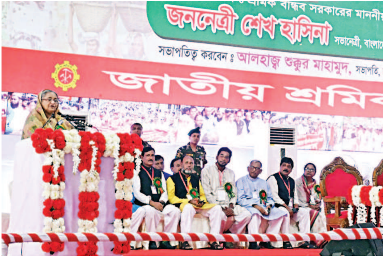
Prime Minister Sheikh Hasina speaks at the opening ceremony of 13th national council of Jatiya Sramik League, the labour wing of Awami League, at Suhrawardy Udyan yesterday morning.