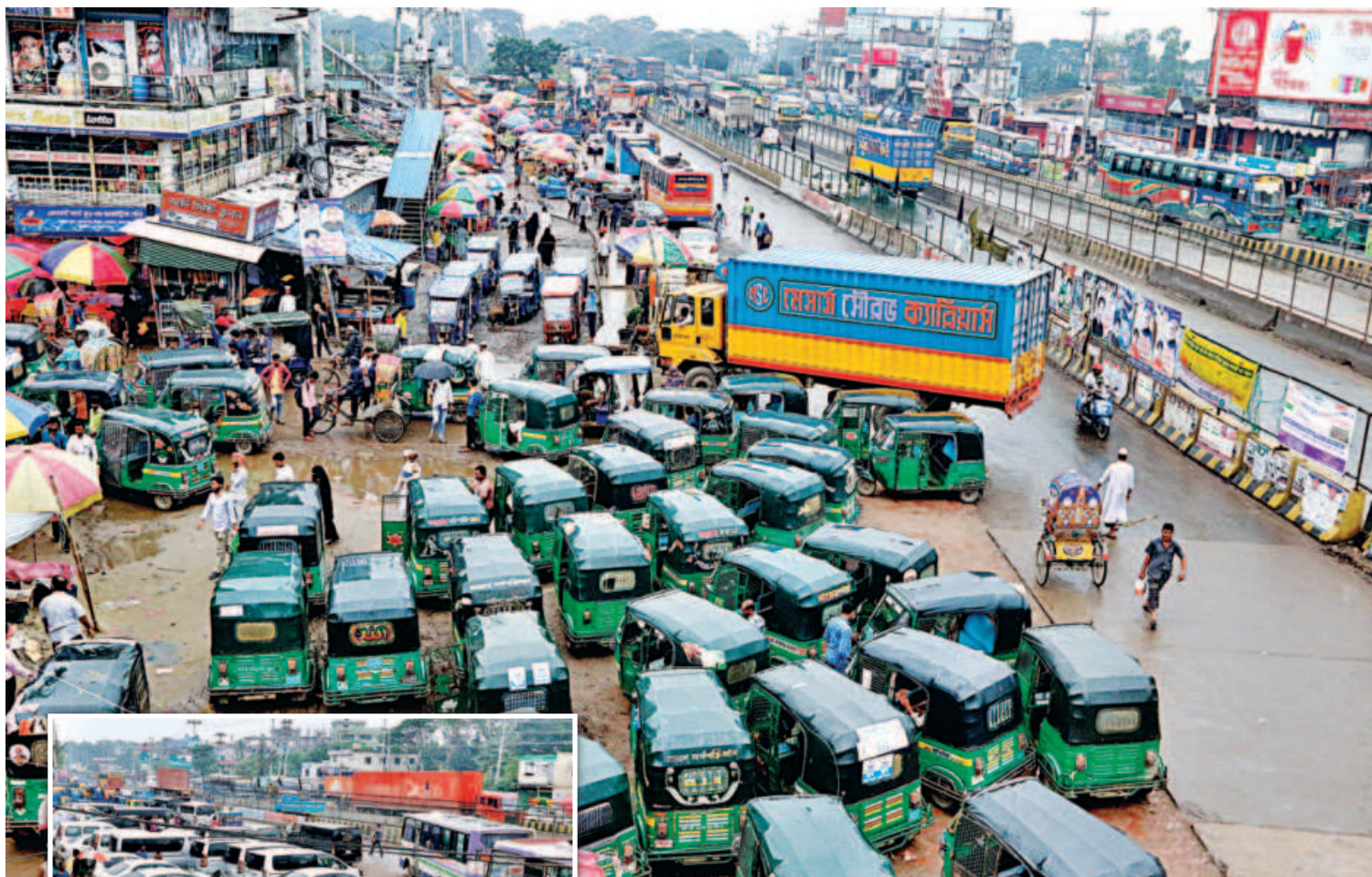
Three-wheelers parked on Dhaka-Chattogram highway near Mograpara intersection in Narayanganj's Sonargaon have left little room for traffic. Inset, the other side of the road is also almost occupied by parked vehicles. Inconsiderate parking is one of the avoidable causes of congestion. The photo was taken yesterday afternoon.

The Daily Star office will remain closed today on the occasion of Eid-e-Miladunnabi. Therefore there will be no issue of the newspaper tomorrow. Stay tuned to our website for round-the-clock news coverage.