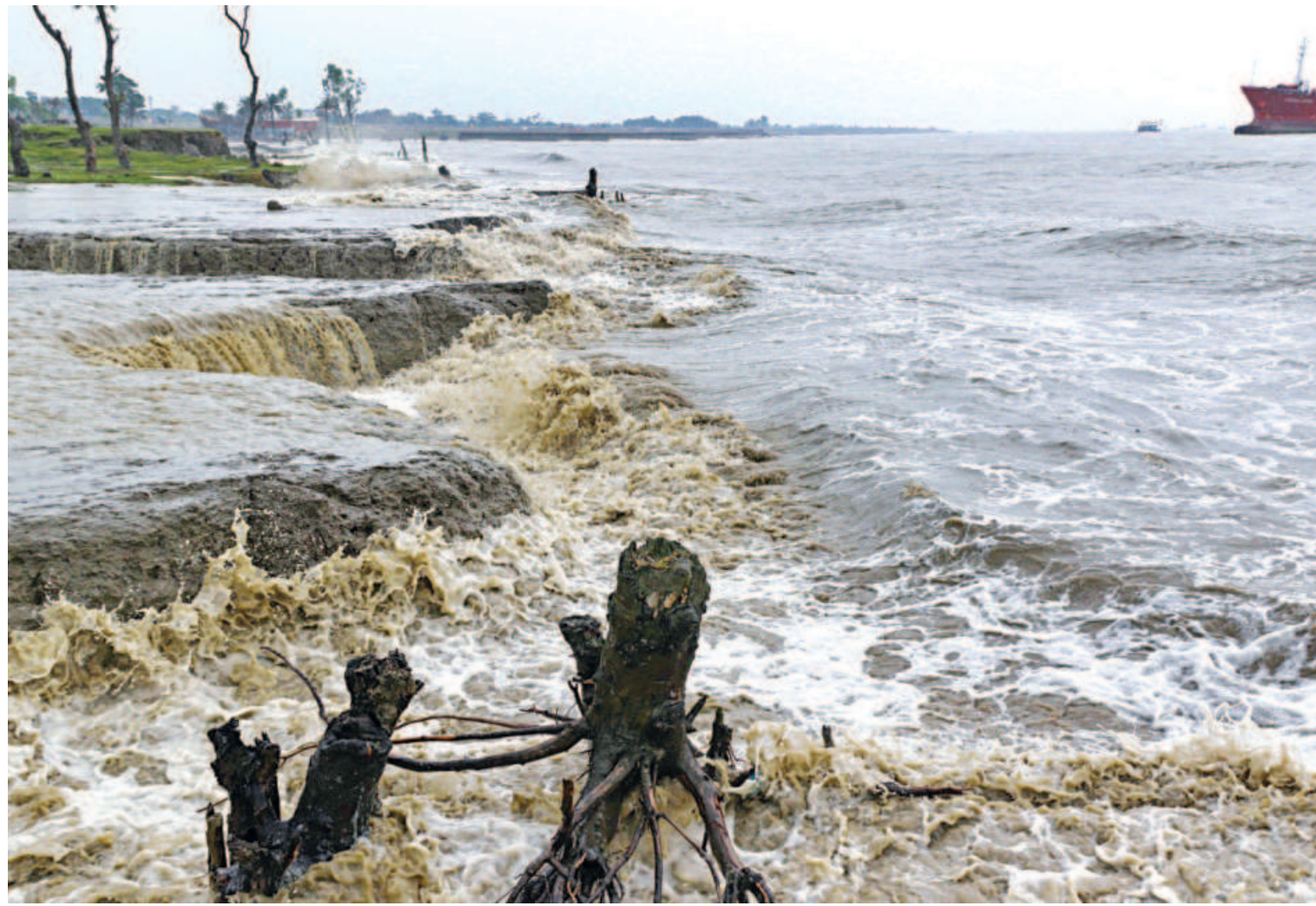
Waves crash over the shoreline in Akmal Ali area of Chattogram city yesterday afternoon, hours before Cyclone Bulbul made landfall. Though the cyclone entered Bangladesh through the Sundarbans, its impact was felt in other coastal regions, including Chattogram.