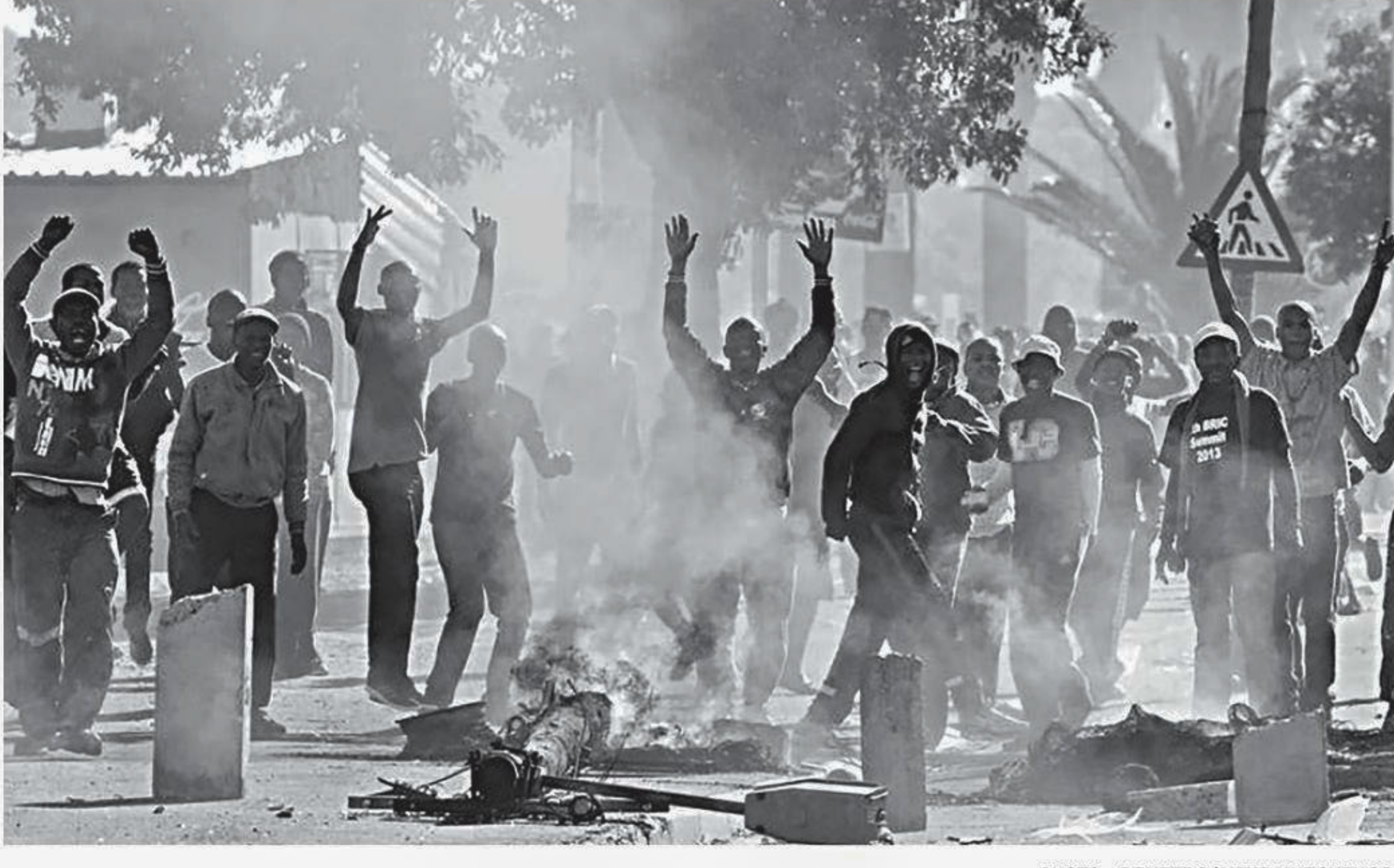
Demonstrators cheer as they tear down a street lamp during a protest against what they said was the government's failure to provide adequate housing facilities and other basic services, in Cape Town's Langa township, July 9, 2014.

liquor at lunch and the rawest spirits at dinner, absolutely neat". That is why no one is ever sober. As a result, anything can happen anytime, and even the police are afraid to enter Langa. See, the police van is waiting on the main road out there." Believe me, I don't remember clearly everything I saw. Whatever I remember, I have no words to describe. The photos taken by the three students reflect