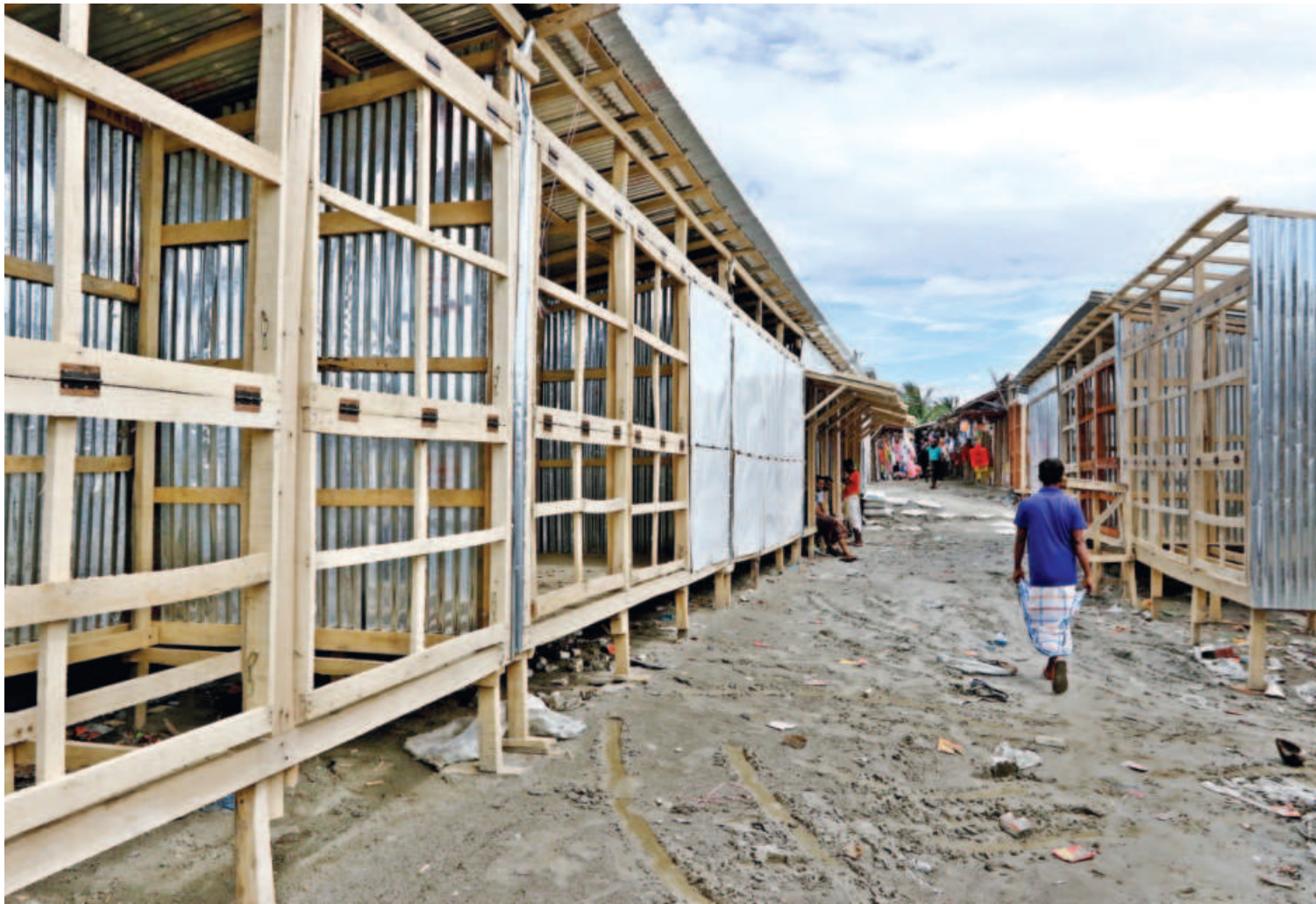
Rows of shops are being constructed illegally ahead of the tourist season on Kuakata beach in Patuakhali. The view on the wide-open beach gets ruined by these shops. Moreover, these shops are a major source of litter that diminish the joy of going to the beach. The photo was taken last week.