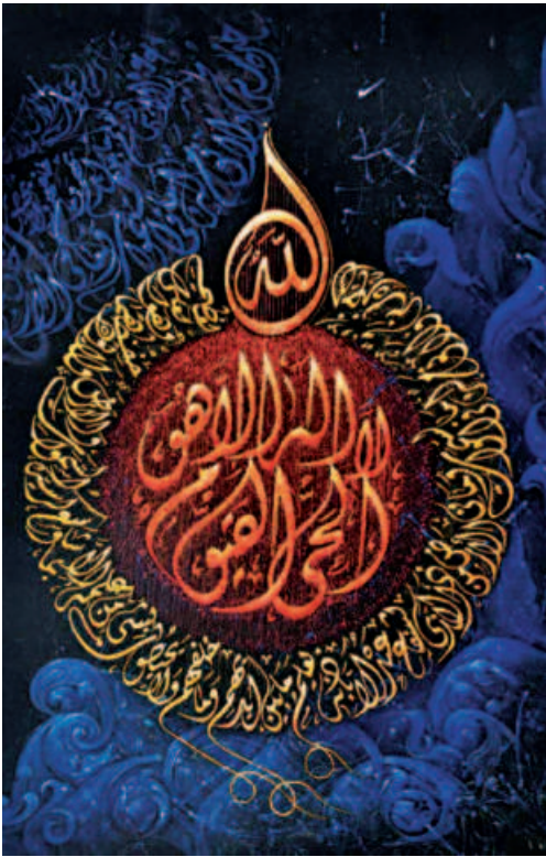
Artworks on exhibit at the event.