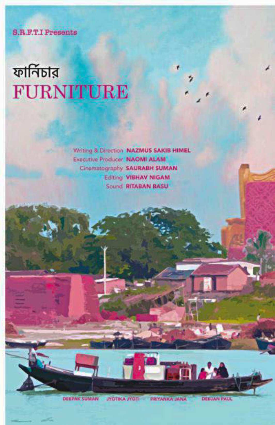
S.R.F.T.I Presents ফার্নিচার FURNITURE