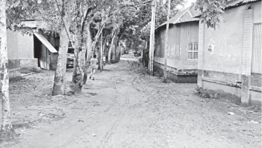
During the rainy season this two-kilometre-long muddy road in Faridpur's Madhukhali upazila remains virtually unusable for vehicles.