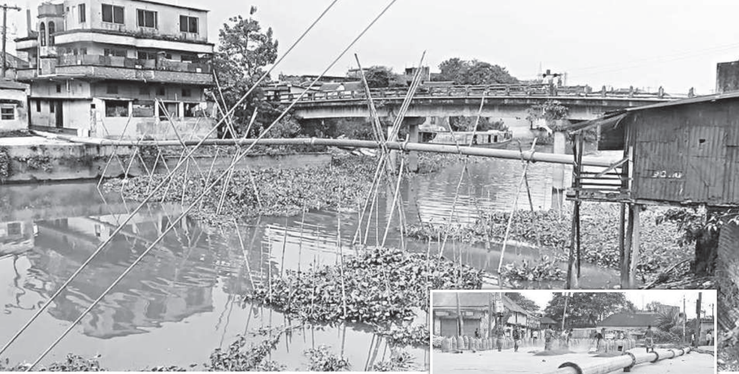
A one and a half kilometre-long pipe runs through public and private-owned areas as a few influential people have taken an intuitive to carry sand from the Dhaleswari river to illegally fill up a large pond at Noidighirpathar under Mirkadim municipality in Munshiganj Sadar upazila.