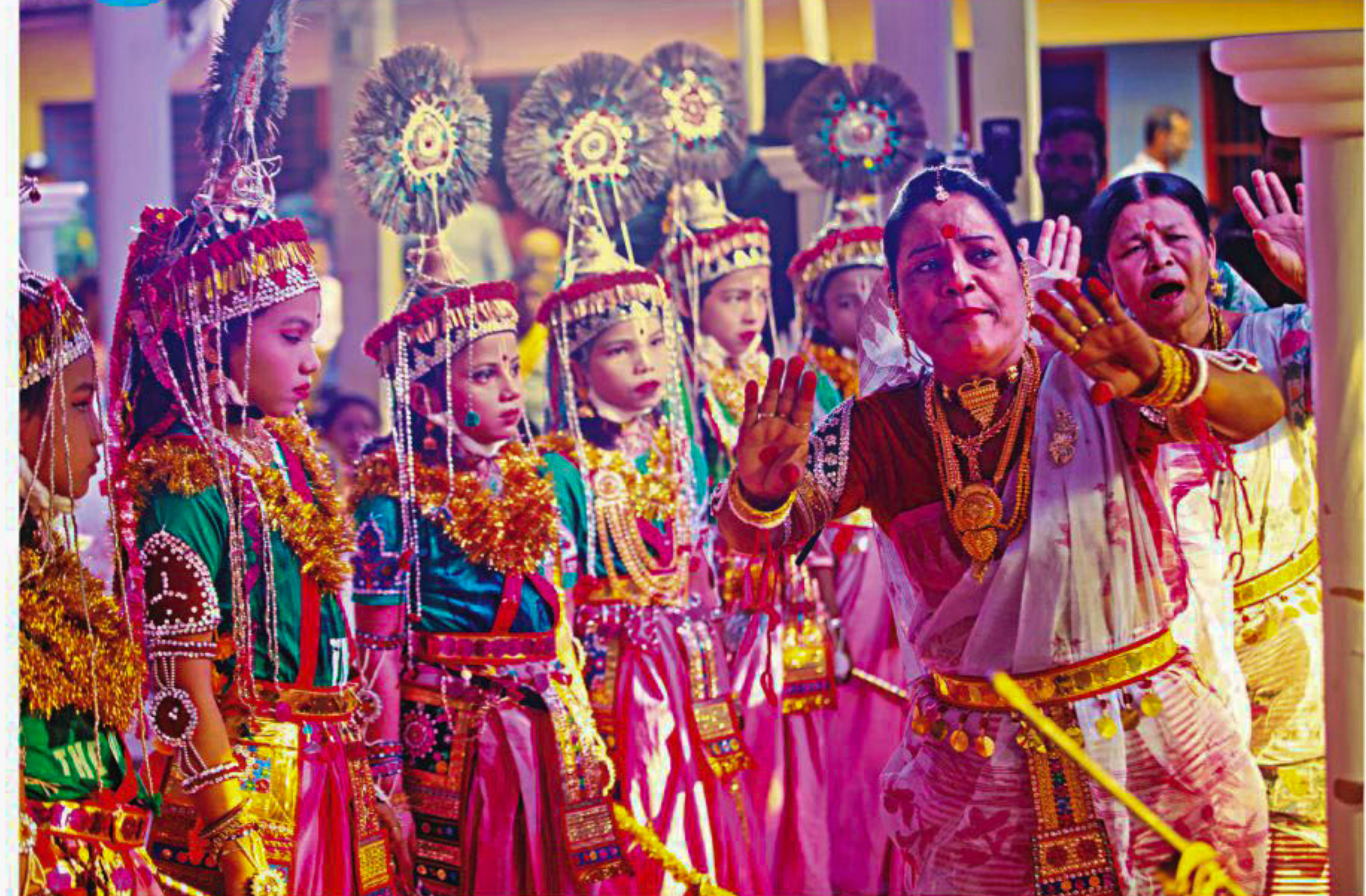
Manipuri children and women perform "Rakhal Nritya" (dance of Sri Krishna and cowherds) at Gopinath temple in Sylhet city's Machimpur area yesterday. The event was organised commemorating Rabindranath Tagore's visit to the temple on November 6, 1919. In Machimpur area, Tagore was introduced to Manipuri dance, art and culture.