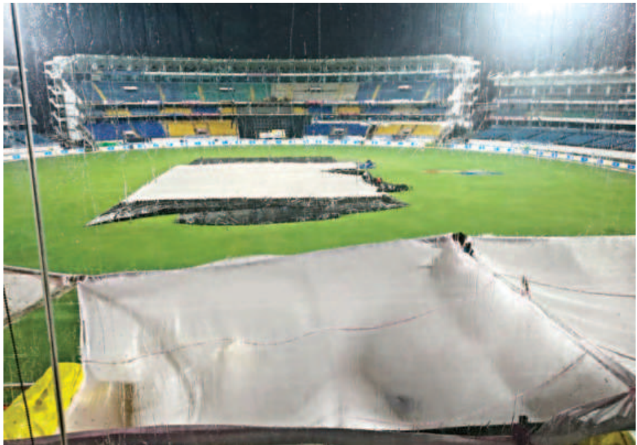
The Saurashtra Cricket Association Stadium where Bangladesh are slated to play the second T20I against India today was put under covers briefly yesterday as the skies opened up under the influence of Cyclone Maha.

"I cannot tell you the strategy but what I can say is that there will be changes in our approach. In the last match, we played according to the pitch. We were playing the way the pitch was reacting. But if the pitch here is good, our approach will be different as well in both bowling and batting."