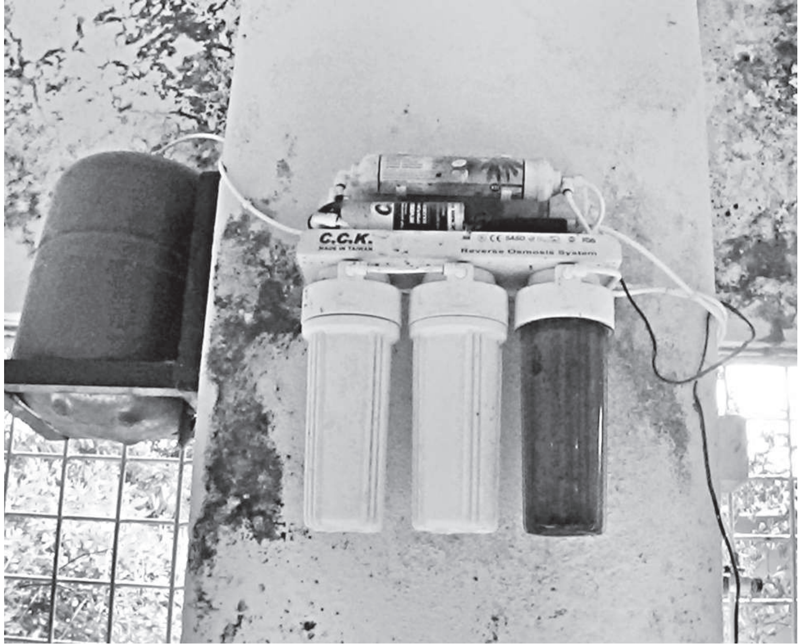
The water filters at Patuakhali General Hospital have gone out of order within three months of installation.

Asked about the high price of these filters, the PWD's official said the prices were accurate, not high.