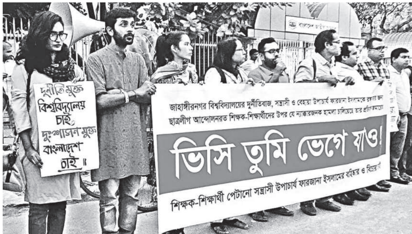
Former students of Jahangirnagar University yesterday protested BCL attack at the university's campus and demanded the VC's resignation. The photo was taken in front of National Museum in Shahbagh.

The success with which corrupt Jubo League leaders have been reigned in for their illegal casino businesses after the PM's directive shows that it is not an impossible thing. Such a directive is now needed to remove all criminal elements