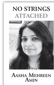
NO STRINGS ATTACHED