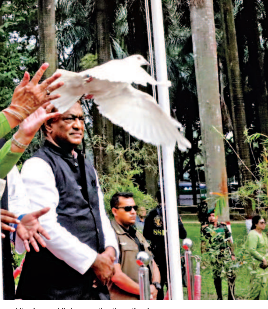
Prime Minister and Awami League President Sheikh Hasina releases a white pigeon while inaugurating the national council of Krishak League at the capital' Suhrawardy Udyan yesterday.