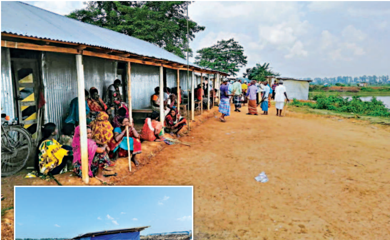
Around 300 Santal families set up makeshift homes in Gaibandha’s Sahebganj, amid looming threats of eviction by the local administration and Rangpur Sugar Mill authorities. They were previously evicted from the area, which they say is where ancestral land is on, in November 2016.