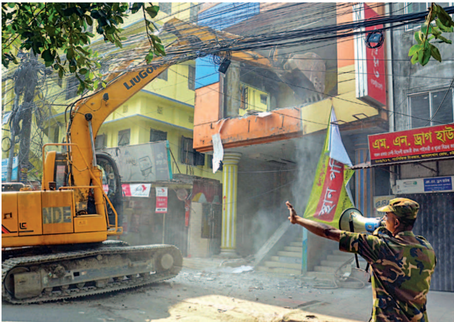
A bulldozer knocks down parts of a building on Jamal Khan Canal during a drive against illegal structures by Chattogram Development Authority. The CDA launched the drive yesterday.