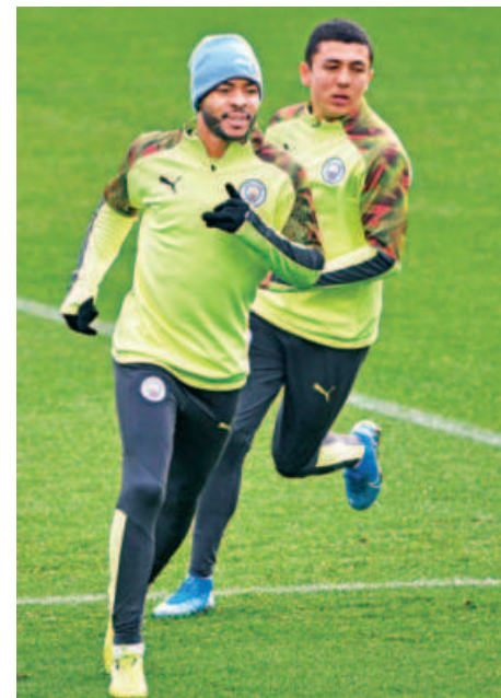
Manchester City star Raheem Sterling (L) attends a training session at City Football Academy in Manchester yesterday on the eve of their Champions League tie against Atalanta.

The 61-year-old's success at Atalanta came eight years after being sacked by Inter Milan after just three months.