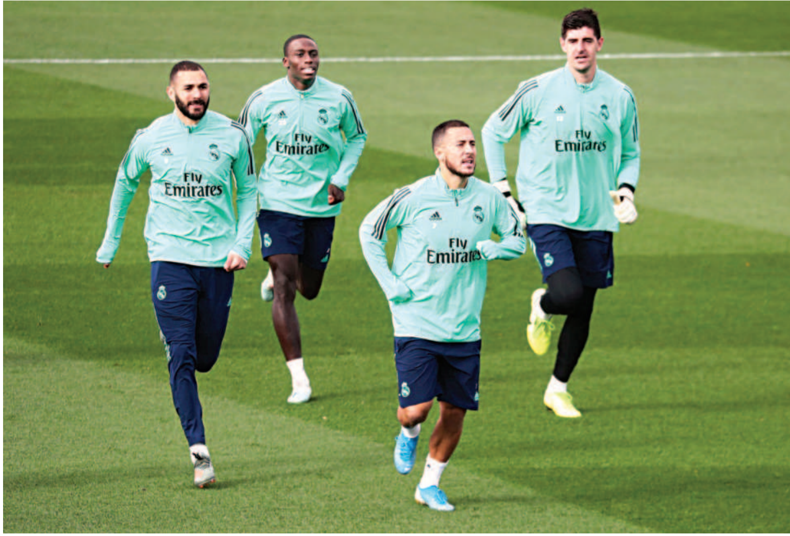
(From L-R) Real Madrid's Karim Benzema, Ferland Mendy, Eden Hazard and Thibaut Courtois jog during a training session at Ciudad Real Madrid yesterday on the eve of their Champions League encounter against Galatasaray.