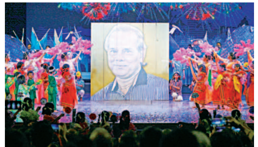
'Aha! Ki Anando'