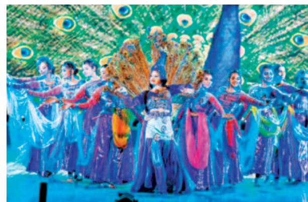
'Moyur Naache Eka'

Soon, a peacock took over the stage with its feathers open, scintillating on the tunes of Megh Gur Gur in the sixth episode, 'Moyur Naache Eka'. The other episodes included 'Tiyer Biye', 'Kajla Didi', 'Bhombol Das', 'Hature Doctor' and 'Golkonna'. The event came to an end with the dance routine 'Aha! Ki Anando'.