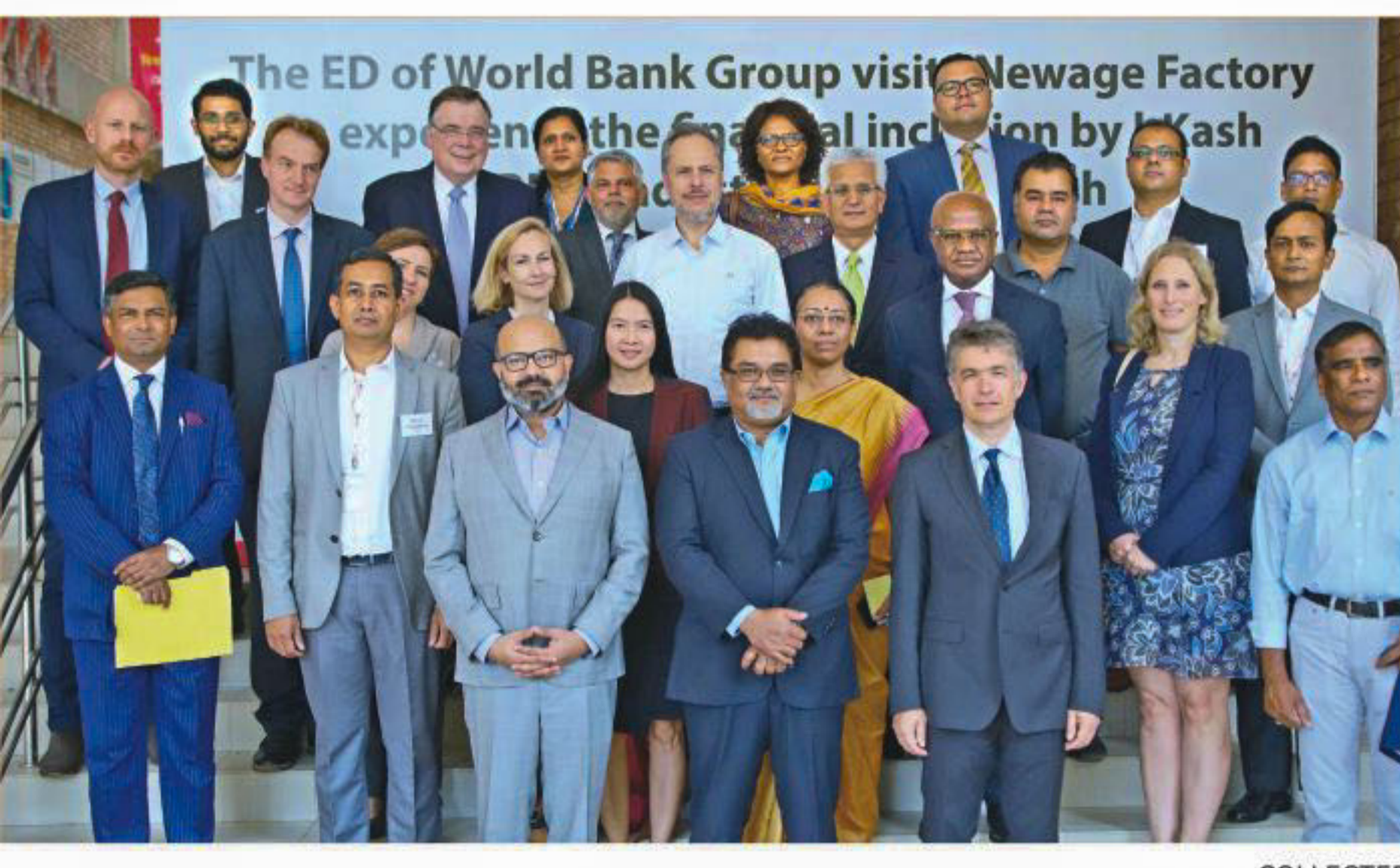
Eleven executive directors of World Bank Group pose during a visit to a garment factory of Newage Group in Ashulia, Dhaka yesterday. They observed how the bKash payroll digitalisation is impacting RMG workers' life and expressed their satisfaction over the ongoing process of wage digitalisation in the sector.