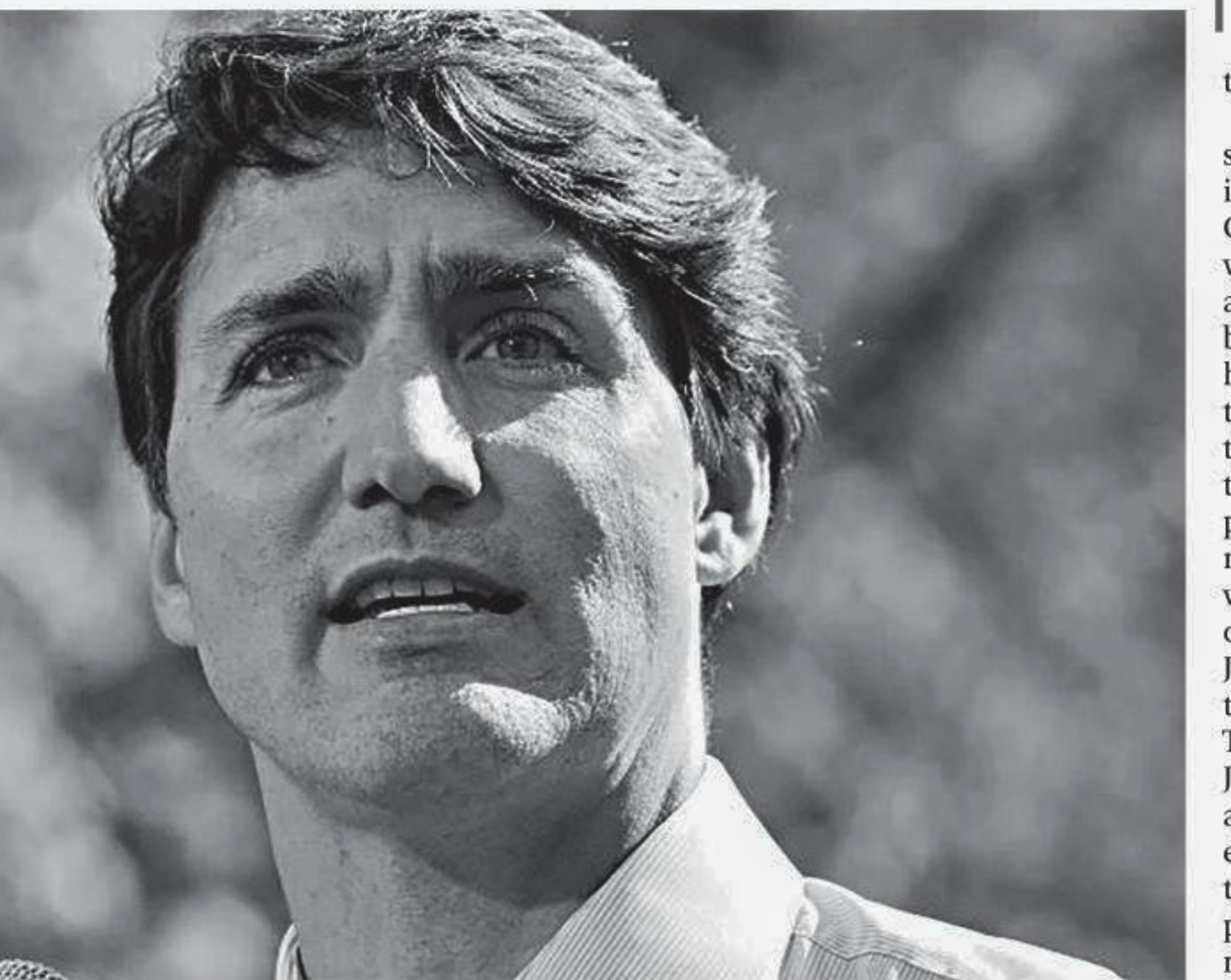
Canada's Prime Minister Justin Trudeau speaks during an election campaign stop in Winnipeg, Manitoba, Canada, on September 19, 2019.

The numbers centring the elections are crucial to understand. The Liberals won a total of 157 seats, dropping their share by 27 from 2015. The Conservatives attained 121 seats, moving up by 22 seats. Immigrant-based communities across the country, amongst which many of the 55,000 to 60,000 Bangladeshi expatriates voted for the first time, leaned strongly towards supporting Trudeau's mandate.