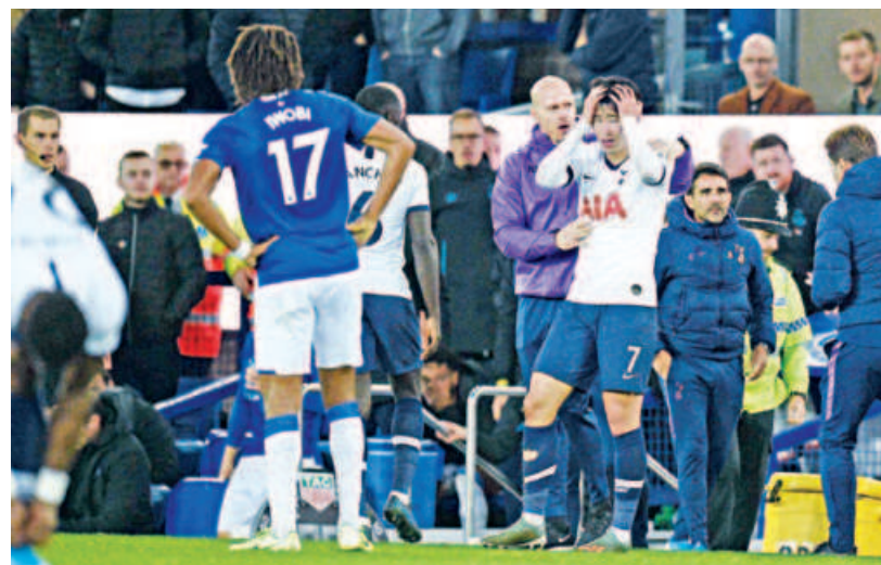
Tottenham Hotspur striker Son Heung-Min (R) reacts after his involvement in an incident resulted in the injury of Everton midfielder Andre Gomes in their Premier League match at Goodison Park on Sunday.

"It is the latest example of it being not clear. VAR needs to check if it was a bad tackle from Son and judge the