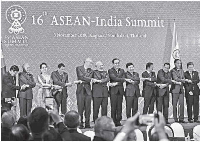
Top leaders of the Asean and India pose for a group photo during the 16th Asean-India Summit in Bangkok yesterday.

New Delhi is worried its small businesses will be hard hit by any flood of cheap Chinese goods creating "unsustainable trade deficits" -- Indian Prime Minister Narendra Modi said in an interview published by the