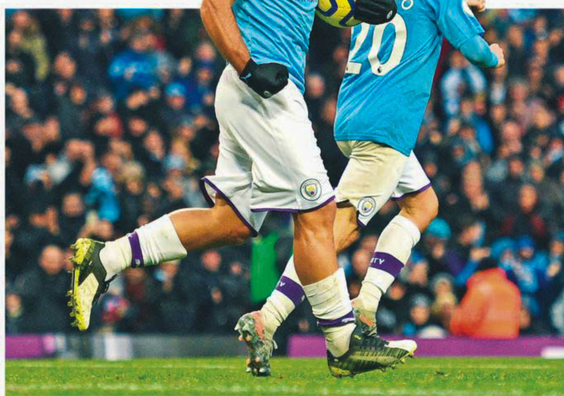
Sergio Agüero's (L) 70th-minute strike brought City level before Kyle Walker eventually got the winner in the 86th minute in a 2-1 win against Southampton yesterday, but Sadio Mané (R) hit a 94th-minute winner after Andy Robertson's 86th-minute leveler to ensure Liverpool beat Aston Villa 2-1 and remain top of the Premier League.

The team is supposed to play a warm-up match on November 9 against a top Omani club as part of their preparation.