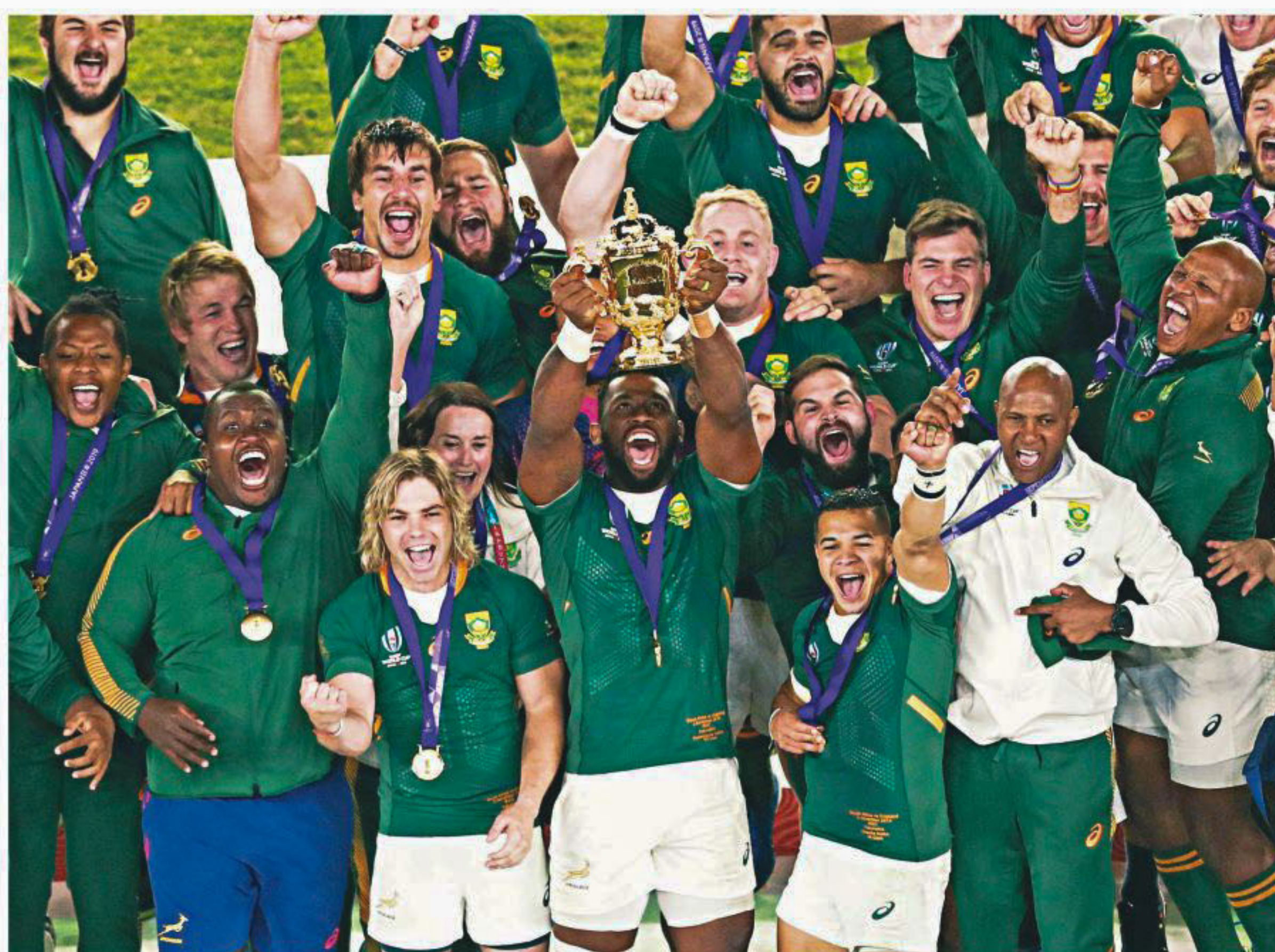
South Africa players celebrate with the Webb Ellis Cup after winning the Rugby World Cup final against England at the International Stadium in Yokohama yesterday.