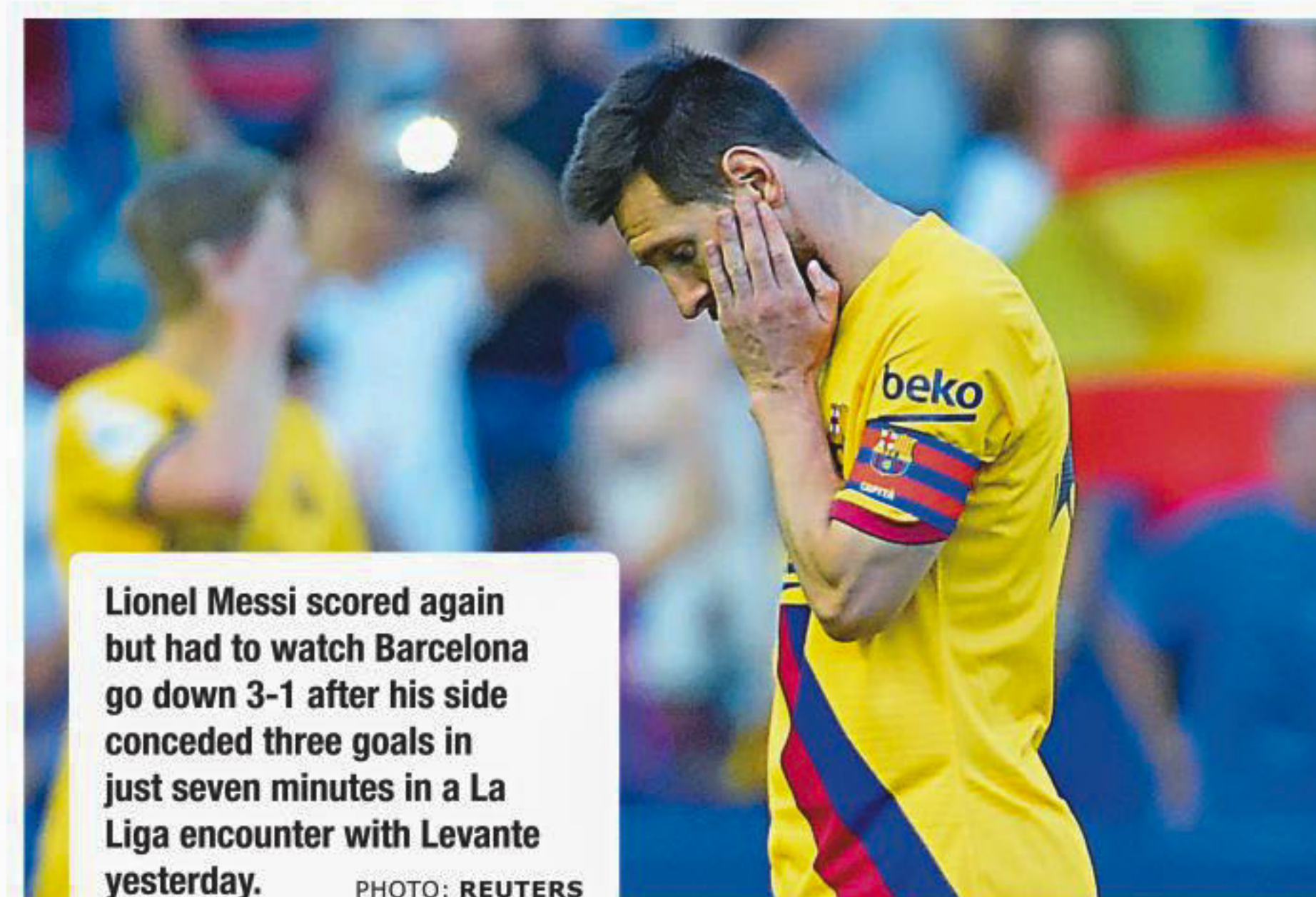
Lionel Messi scored again but had to watch Barcelona go down 3-1 after his side conceded three goals in just seven minutes in a La Liga encounter with Levante yesterday.

"It's not a huge wonder (that this happened)," fumed Bayern captain Manuel Neuer. "Things had already got off to a (bad) start." "That (the red card) didn't make it any easier, of course, but still you can't concede five. We're not consistent in our defence."