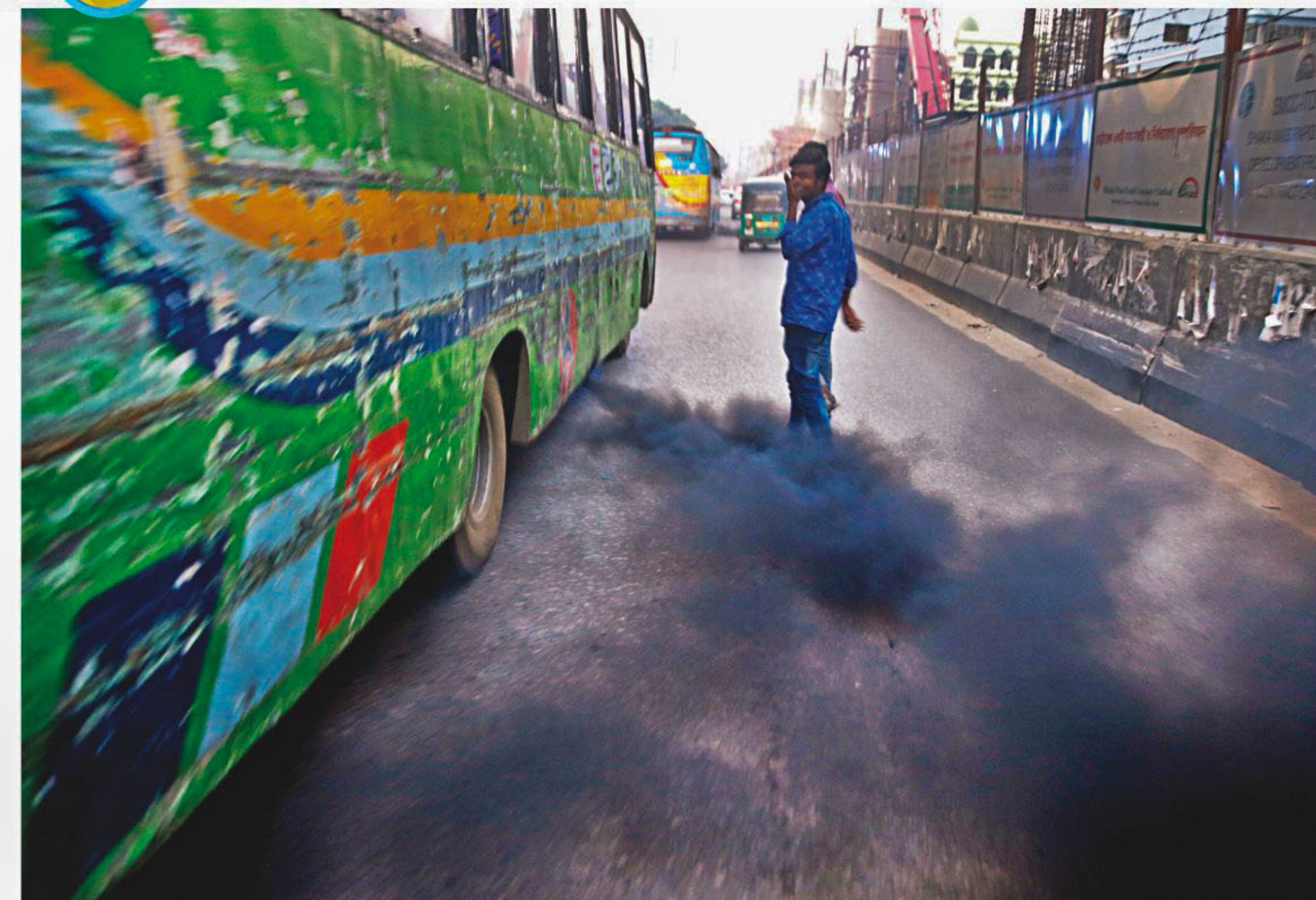
A bus emits black smoke forcing two jaywalkers to cover their mouths. The new Road Transport Act came into effect on Friday with provisions for harsher penalties and stringent punishments for violation of traffic rules. But unfit vehicles continue to ply the city roads while drivers and pedestrians flout the rules. The photo was taken on Kazi Nazrul Islam Avenue near Sonargaon Hotel yesterday.