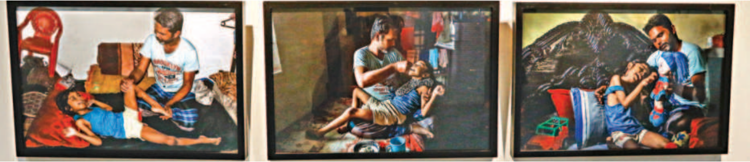
Photographs on exhibit.