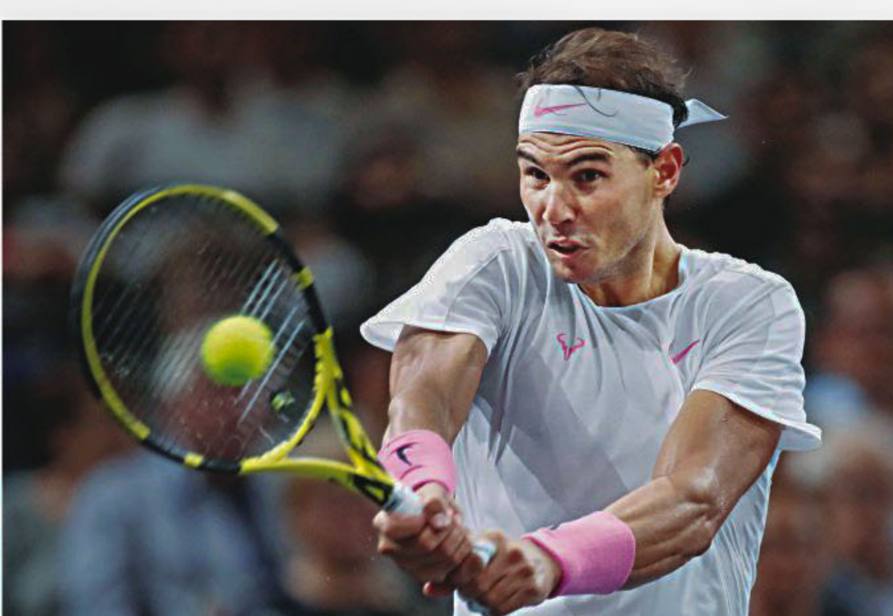
Rafael Nadal hits a backhand return to Stan Wawrinka during their Paris Masters match at The AccorHotels Arena on Thursday.