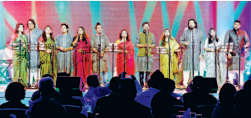
A group performance by Bangladeshi artistes.