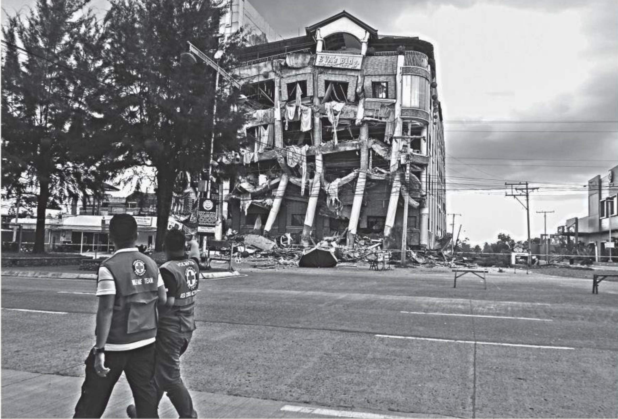
Local Red cross personnel walk past a damaged building after a 6.5-magnitude earthquake hit Kidapawan town, north Cotabato province, on the southern island of Mindanao, Philippines yesterday. At least five people were killed and nine people were injured in the earthquake.

Measurements across the river "are significantly below the minimum levels for this time of year and are expected to decrease further", it said in a statement to AFP.