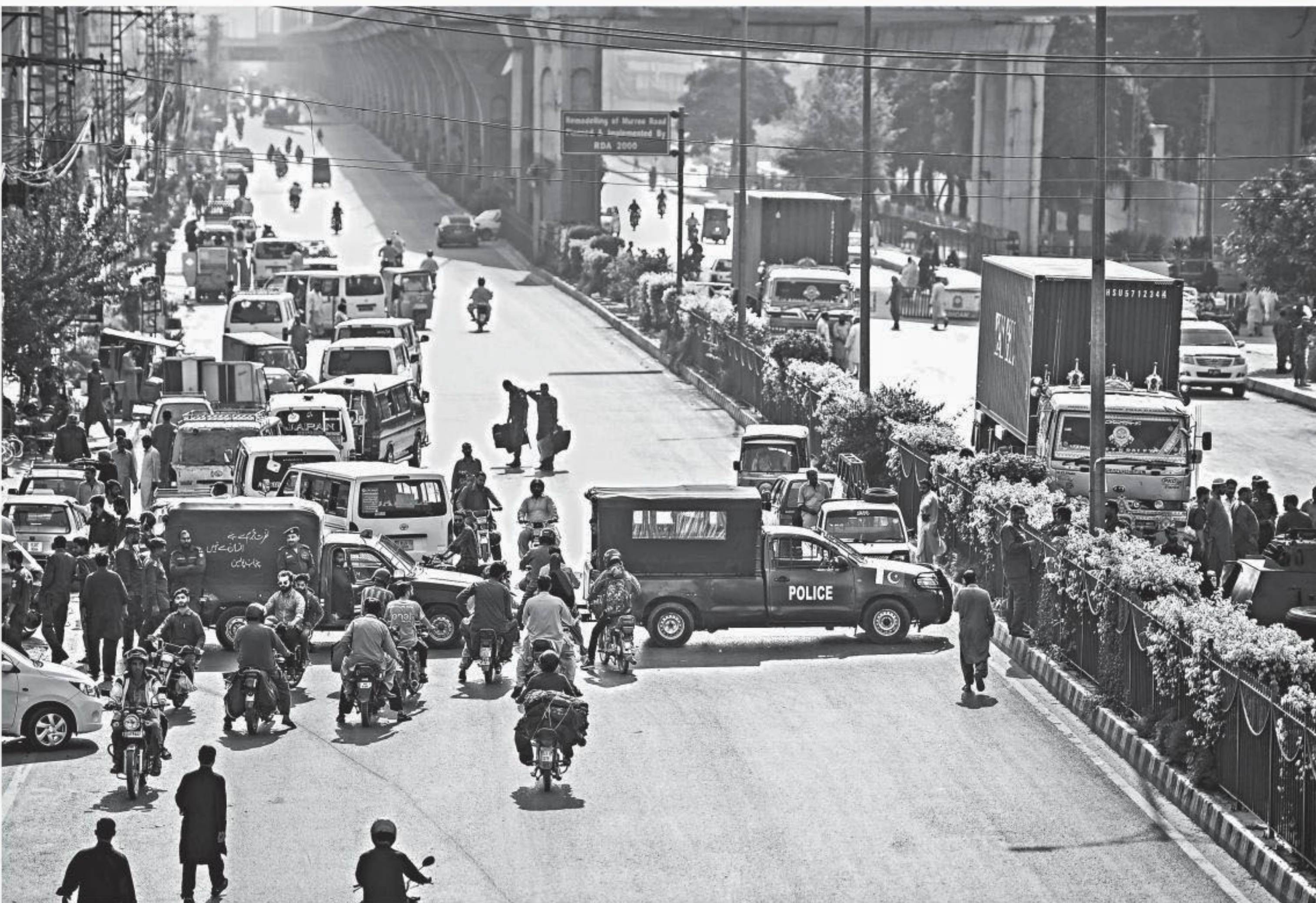
Commuters cross a road blocked with police vehicles, during an anti-government "Azadi March" led by Jamiat Ulema-e-Islam Chief Maulana Fazlur Rehman, in Islamabad, Pakistan yesterday.

The Malaysian financier at the heart of the massive 1MDB graft scandal has struck a settlement to forfeit assets worth $700 million including a Beverly Hills hotel and a private jet, the US Justice Department said Wednesday. Jho Low will relinquish the assets under the largest ever US civil forfeiture, intended to recover cash allegedly stolen in the 1MDB scandal which helped topple Malaysia's corruption-plagued former regime.