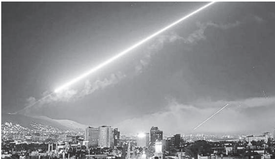
Damascus skies erupted with missile fire as the US, UK and France launched an attack on Syria targeting different parts of Damascus on April 14, 2018.