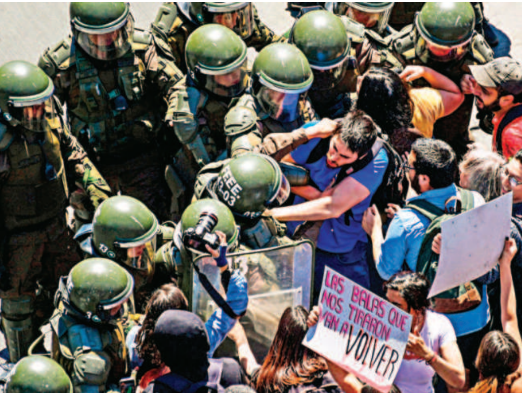
Security forces push demonstrators during scuffles in front of the Presidential Palace, known as La Moneda, in Santiago, Chile, on Monday. Chilean President Sebastian Pinera unveiled a major cabinet reshuffle on Monday as he battles to find a response to more than a week of street protests that have left at least 20 people dead.