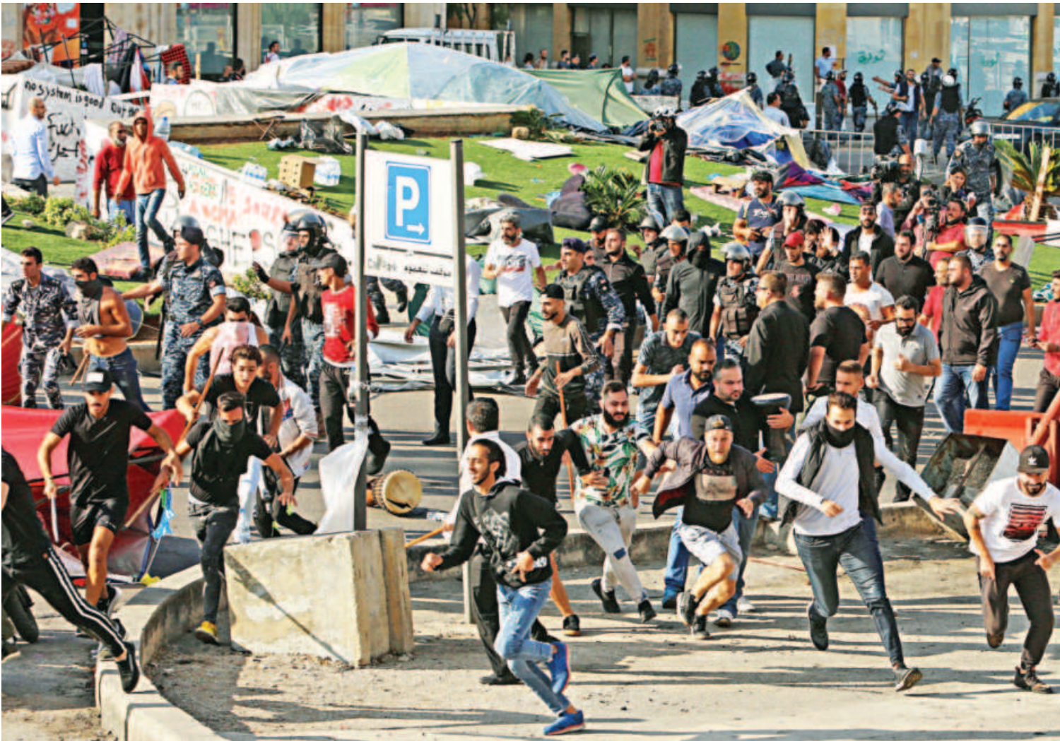
People run during an attack on a camp set up by anti-government demonstrators in central Beirut, yesterday.

Egyptian security forces killed 13 suspected militants in a raid in the restive North Sinai, the interior ministry said yesterday. Police raided a hideout in a deserted farm house in El-Arish, provincial capital of North Sinai, triggering a shootout, the ministry said in a statement. Weapons including explosive devices, rifles and guns were found, it said, without giving the date of the operation.