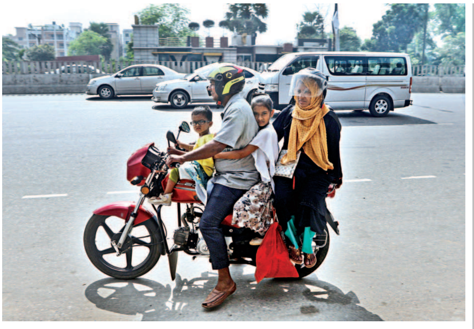
A man talks on a phone while on a motorbike with three other passengers on Airport Road in the capital's Kurmitola area yesterday. The two children are not even wearing helmets. Such flouting of traffic rules and carelessness towards safety often lead to fatal road crashes.

Rahman in the chair. On this day in 570, the 12th of Rabiul Awal of the Hijri calendar, Prophet Muhammad (pbuh) was born in Makkah of Saudi Arabia with divine blessings and messages of peace for mankind. He also passed away on the same day.