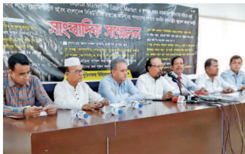
Stock investors attend a press conference at the National Press Club in Dhaka yesterday.

"So, the stock market continues to suffer."