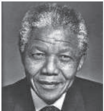
NELSON MANDELA (1918-2013) President of South Africa

A good head and good heart are always a formidable combination. But when you add to that a literate tongue or pen, then you have something very special.