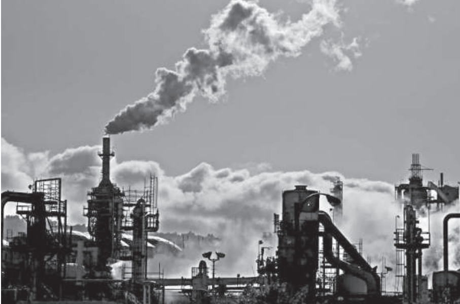
The threat of climate change is growing more real and more urgent by the day.

“The sustainability of the environment, once mistakenly thought to compete with economic development, is now understood to be complementary and necessary to ‘end poverty in all its forms everywhere’”. According to Isabell Kempf, “New tools of economic analysis and transparency that reveal the true value of natural capital and sustainable ENR management mobilise support for poverty-environment mainstreaming within government.” This is true for Bangladesh as well, a country that stands in the line of fire in the fight against climate change. We have 40 million people in our country