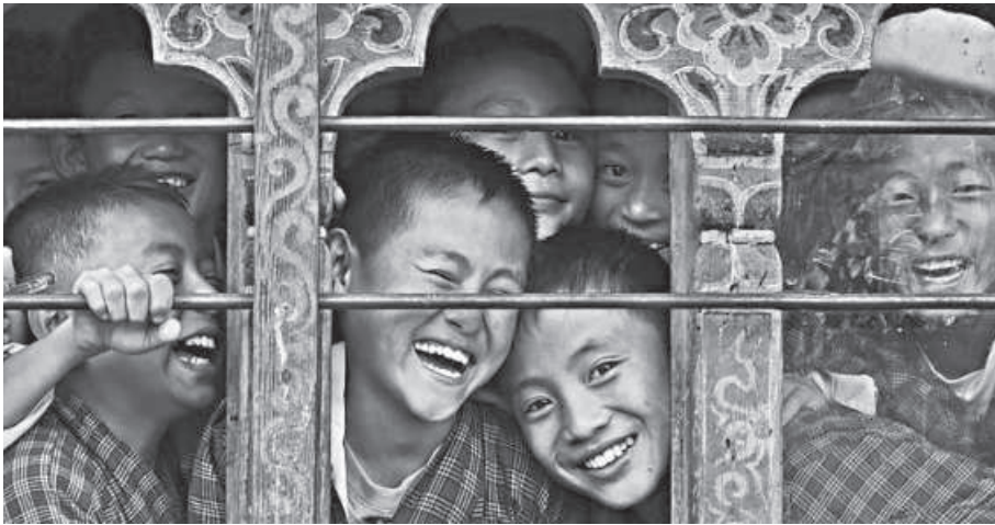
Bhutan uses ‘Gross National Happiness’ to measure human development rather than GDP.

The village astrologer, the lay monk, the lead singer, the carpenter, the arrow maker, the elders and the youth, all had their responsibilities. The values, drawn from Buddhist teachings, from the experience and wisdom of our ancestors and from the very practical needs of a subsistence farming lifestyle, inculcated a reverence for an interdependent existence with all life forms, or all sentient beings. Some examples of this are seen in the reluctance to hunt and fish (both of which are banned in the country), the sometimes frustrating tendency to be less “productive” to avoid hurting or upsetting someone, and putting up with the cacophony of an unruly stray dog population. People identified their own priorities in life.