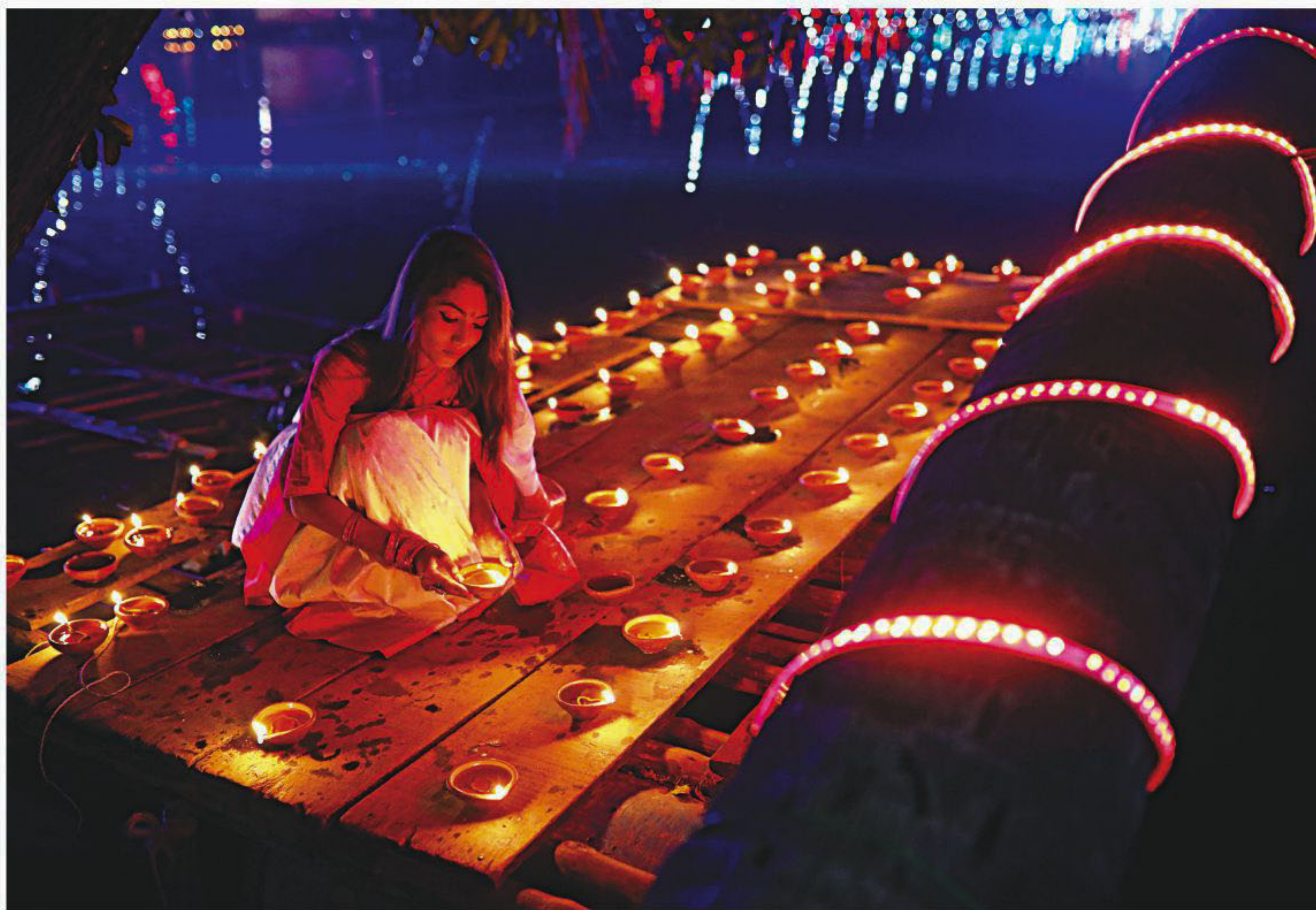
A devotee lights oil lamps as she takes part in Diwali celebrations in Dhaka yesterday. Diwali, the Festival of Lights, marks victory over evil and commemorates the time when Hindu god Lord Rama achieved victory over Ravana and returned to his kingdom Ayodhya.