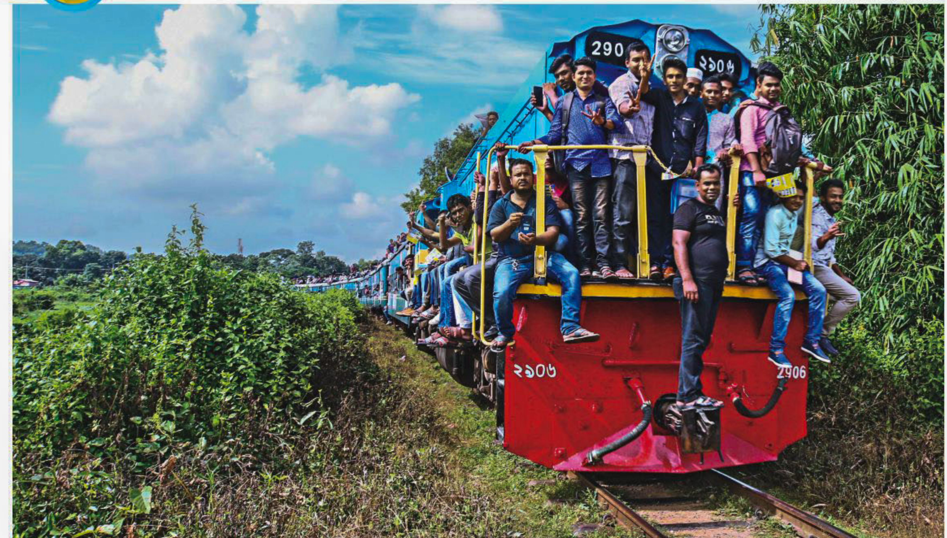
Admission seekers to Chittagong University make a joyride of their commute back to the port city on a packed-to-brim shuttle train, as it leaves the campus after the entry test. The photo was taken near the university around 1pm yesterday.