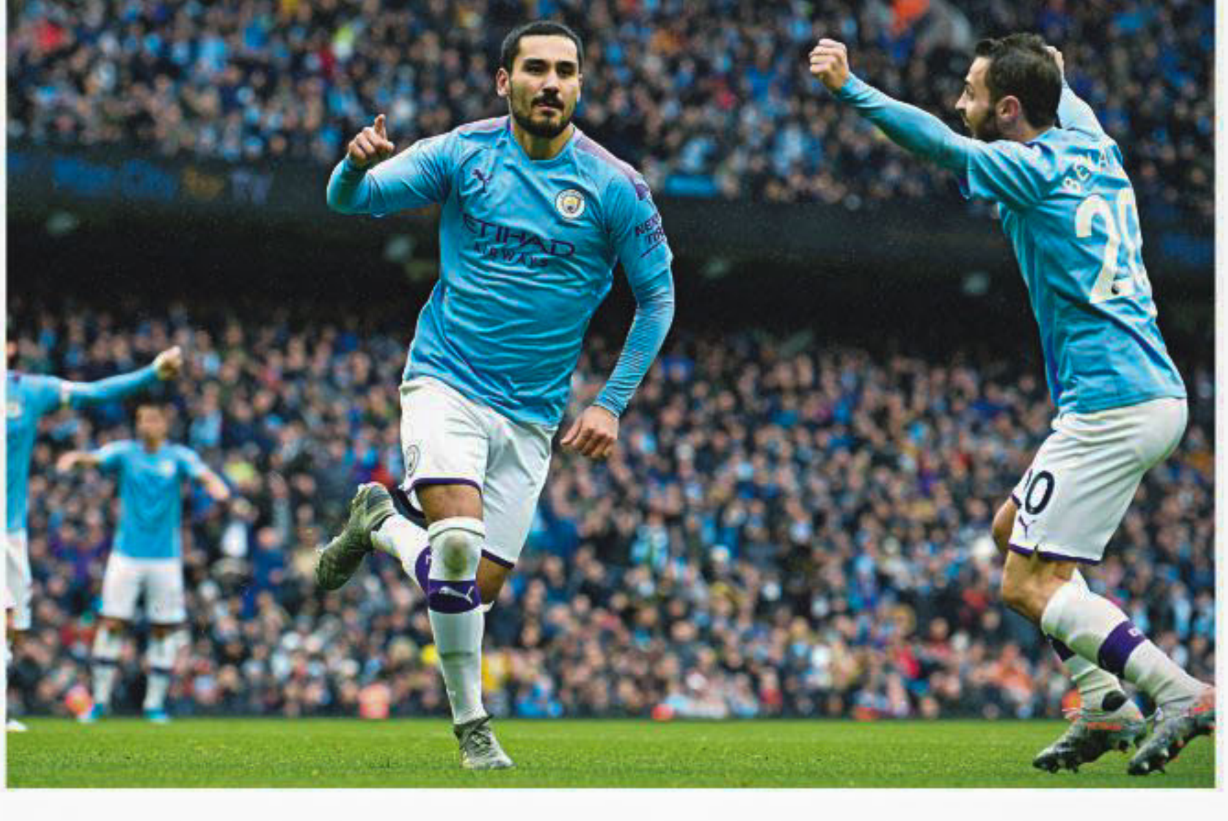
Manchester City midfielder Ilkay Gundogan (C) celebrates after scoring the third goal against Aston Villa during their Premier League encounter at the Etihad Stadium yesterday.