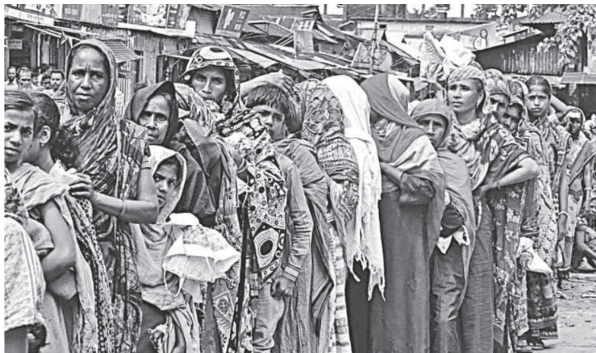
Many of the excluded and marginalised communities are numerically small and thus struggle to project a collective identity.

Economists have understood the problem of poverty and extreme poverty in terms of a lack—lack of income or lack of resources or, as Amartya Sen pointed out, lack of capabilities. The excluded and marginalised groups may also be lacking all of the above, but what distinguish them from the general category of poor and extreme poor are the walls of discrimination and highly negative social perceptions that not only often render them socially and statistically invisible, but also serve to downgrade their own sense of self-worth and their sense of agency. Not surprisingly, while many among the poor have embraced an aspirational mindset which refuses to accept that "poverty is destiny", the excluded and marginalised groups struggle to make a transition