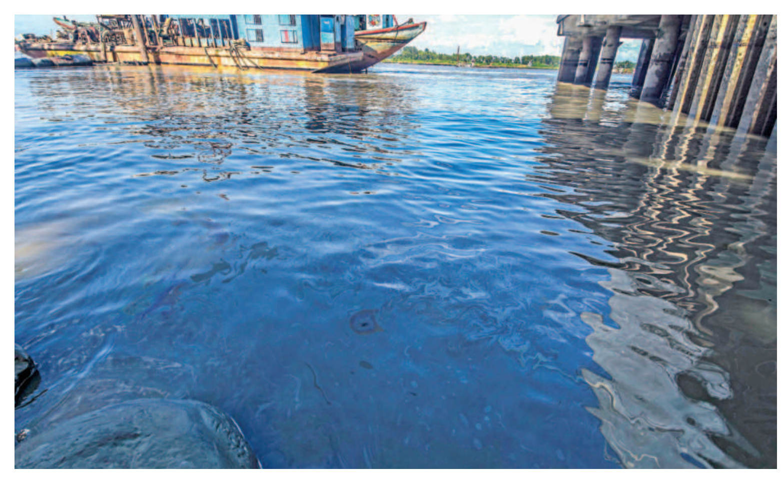
Oil floats on water after it got spilled into the Karnaphuli following a collision between an oil tanker and a lighter vessel early Friday. Around 10 tonnes of oil spilled into the river due to the collision. Chattogram Port Authority is conducting a cleaning operation. The photo was taken yesterday.

Additional Inspector General of Police Mainur Rahman Chowdhury attended the programme as special guest.