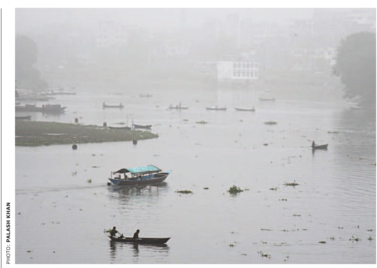
WINTER IS ALMOST HERE! A chilly morning coated in a blanket of fog over Turag river greeted locals yesterday.